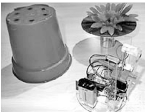
Underneath the pot the flower is not so pretty