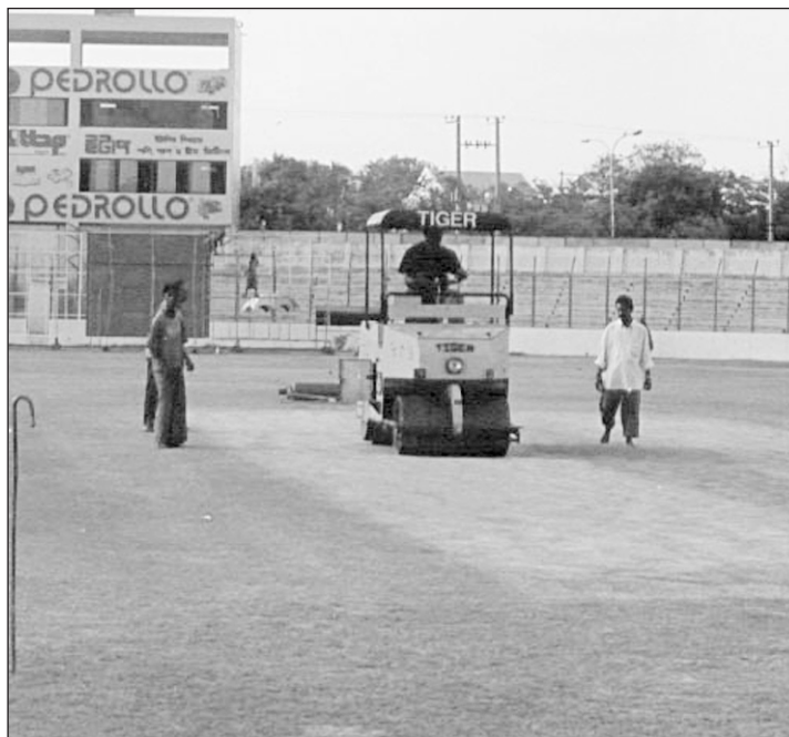
(L) Groundsmen roll the pitch as they are putting final touches to the MA Aziz Stadium yesterday. The first Test between South Africa and Bangladesh starts here tomorrow. (R) Bangladesh cricketers play football during a practice session at the venue.