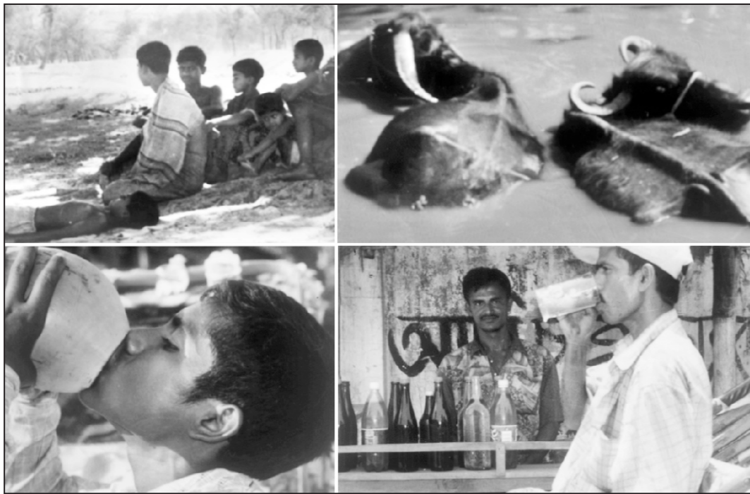
People become tired quickly due to scorching heat of the ongoing summer. So, everyone including animals try to make life a bit comfortable through various means. (Top left) Rural youngsters take rest under a banyan tree, while two buffaloes try to get rid of scorching heat making a dip in a pond (right). (Bottom left) A rickshaw puller quenches his thirst drinking sweet water of a green coconut and another fellow mate of his profession (right) drinks 'Sharbat' made by mixing molasses with water.

Diarrhea and other water-borne diseases are prevalent among slum children. About four per cent boys and 6.7 per cent girls below five years fall victims of diarrhoea. Prevalence of diarrhoea is higher among girls irrespective of age group. Nearly 4.1 per cent male members and 4.6 per cent female members usually suffer from skin diseases.