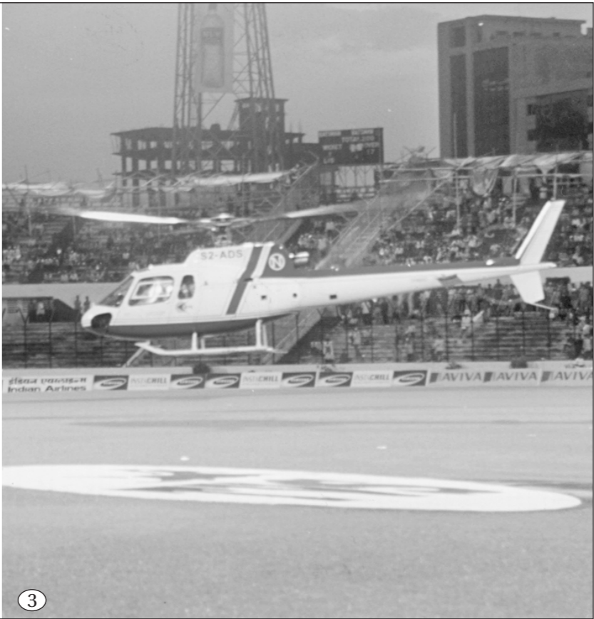
BEATEN BY THE NOR'WESTER! (1) Indian batsman Yuvraj Singh runs for his life towards the dressing room while South African all-rounder Jacques Rudolph follows him after the rain came pouring down. (2) Groundsmen rush towards the pitch area with covers. (3) The organisers left no stone unturned to make play possible. They even brought in a helicopter to dry the outfield, albeit in vain.