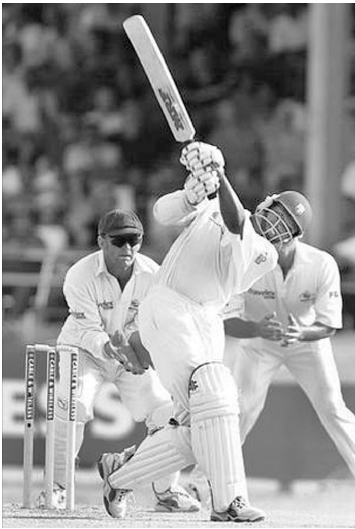
West Indies' Brian Lara whacks one over long-on during his knock of 91 against Australia in the second Test in Port-of-Spain on April 20.