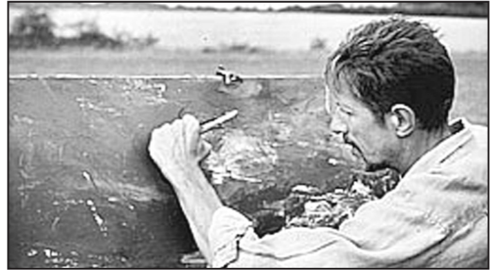
Jacques Dutronc in the title role of Van Gogh (1991) by Maurice Pialat

Pialat left behind him a legend like that of our very own Ritwik Ghatak which lives with time and is never forgotten. Maurice Pialat died in Paris on 11 January 2003 of kidney failure. We pay our tribute to this great filmmaker.