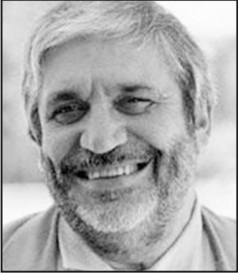
Maurice Pialat (1925-2003) nineteenth century French Catholic writer Georges Bernanos, explores the inner life, temptation and turmoil of a rural priest.

To Our Loves (1983) marks a significant turn in his career when his films become more and more intense and demanding by adopting an autobiographical tone and style. It is a family drama focusing on the promiscuity of a teen-aged daughter. The film won the 'Cesar', the French 'Oscar', for best film and introduced a new actress Sandrine Bonnaire to the audience who would later on become one of the best French actresses of the 1980s and 1990s. Police (1985) is a film about a cop (Gerard Depardieu) who is after the criminals and with him we are drawn into the darker side of human nature. A dutiful cop, he gets in touch with a thief (Sophie Marceau). Pialat's pessimism about the society in decadence is evident here. Under the Sun of Satan (1987) won the best film prize 'Golden Palm' at Cannes Film Festival. The film, based on the novel by the