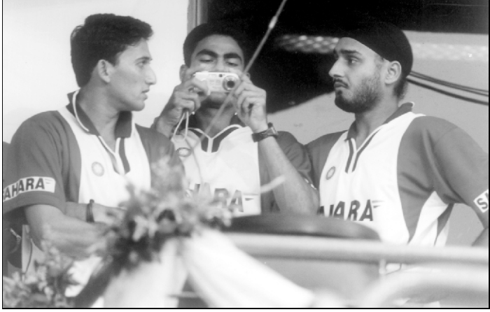
DID HE BUY THIS FROM THE ELECTRONICS MARKET OUTSIDE THE STADIUM? Indian players Ajit Agarkar (L) and Harbhajan Singh (R) talk while Mohammed Kaif tests his camera at the Bangabandhu National Stadium yesterday.