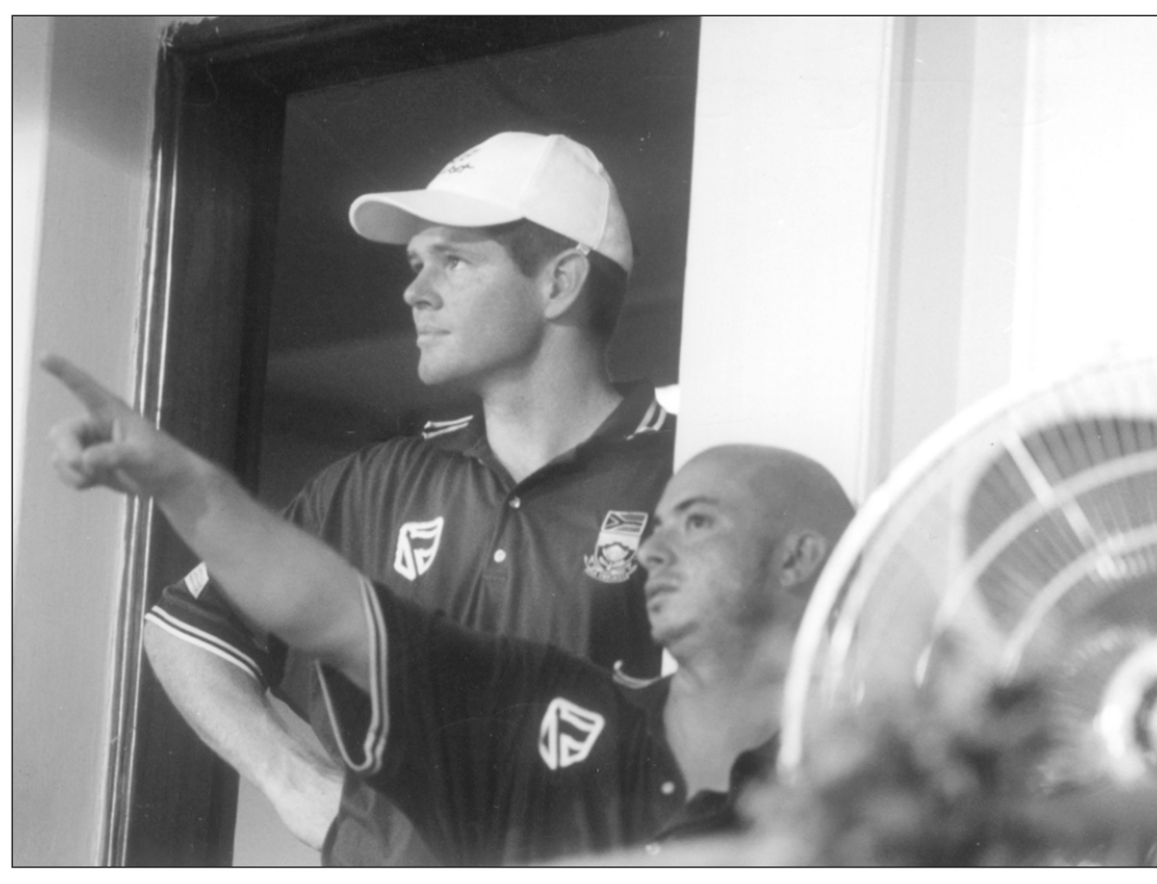
THAT RAIN IS NEVER GOOD NEWS FOR US! South African opening batsman Herschelle Gibbs (R) points towards the skies while all-rounder Shaun Pollock watches from the dressing room door at the Bangabandhu National Stadium yesterday.