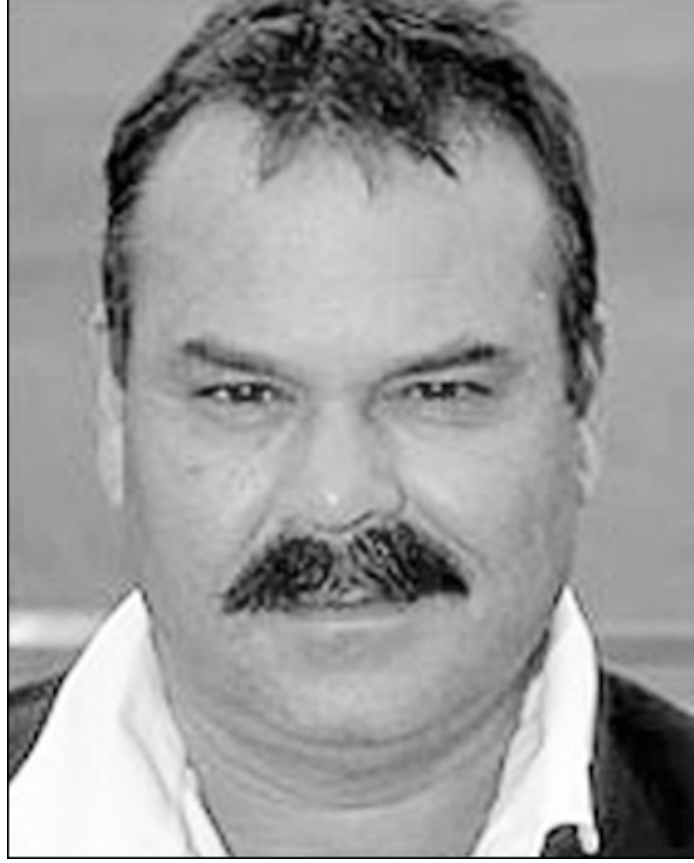
World Cup. 2003, Whatmore decided to... Although his contract with the Sri Lankan Board was up to the end of May... SEE PAGE 14 COL 5

In his first stint as Sri Lanka's national coach, Whatmore had a highly rewarding 20-month spell that culminated in Sri Lanka's 1996 World Cup triumph. He then spent two years with English county side Lancashire before heading back to Sri Lanka after the 1999