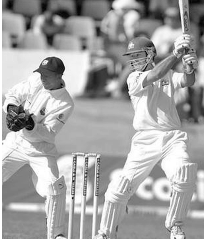
Australia's Ricky Ponting square cuts on the opening day of the second Test match against the West Indies.