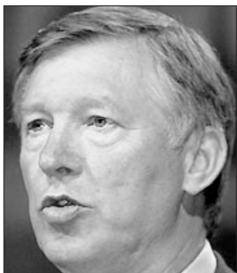
SIR ALEX FERGUSON

Chelsea, who currently have a four-point cushion over Everton in fourth place, travel to Aston Villa, who, in common with Leeds, Fulham and Birmingham still need a few points to be sure of Premiership survival.