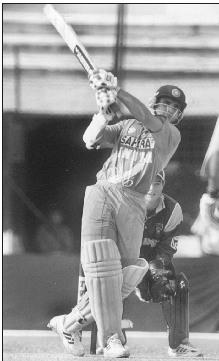
India captain Saurav Ganguly hoists South Africa's Paul Adams towards long-off during their TVS Cup tri-series clash at the Bangabandhu National Stadium yesterday.