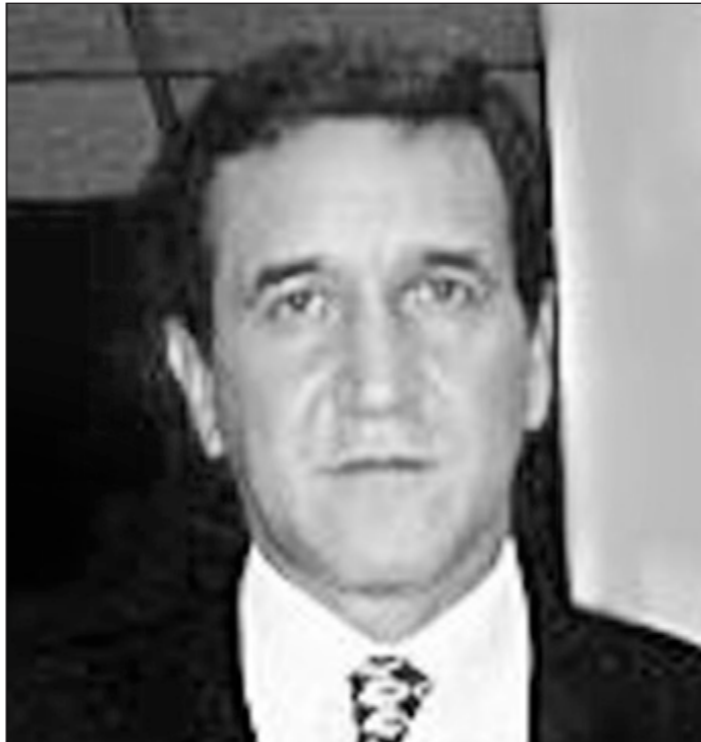
CARLOS ALBERTO PARREIRA

Brazil face Mexico in Guadalajara on April 30. The home-based players will be named next week.