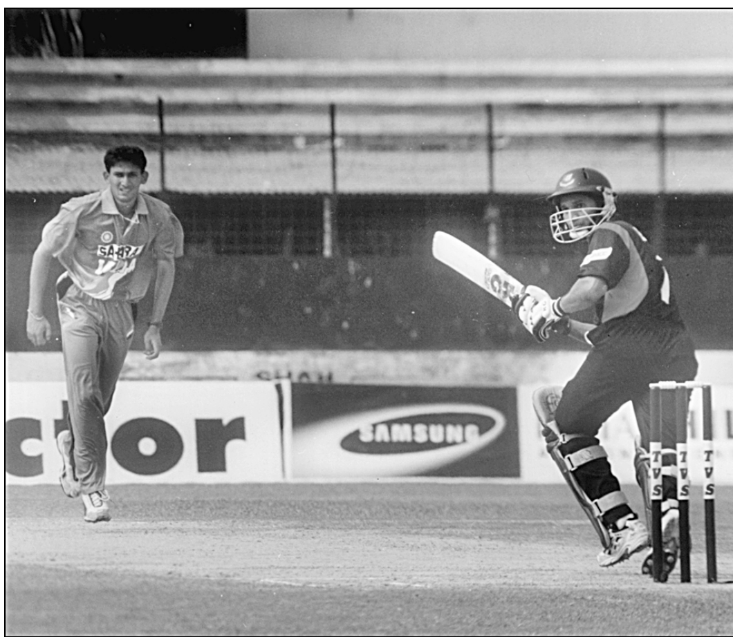
FINALLY! Bangladesh batsman Habibul Bashar turns Indian paceman Ajit Agarkar to the leg side during his half-century yesterday.