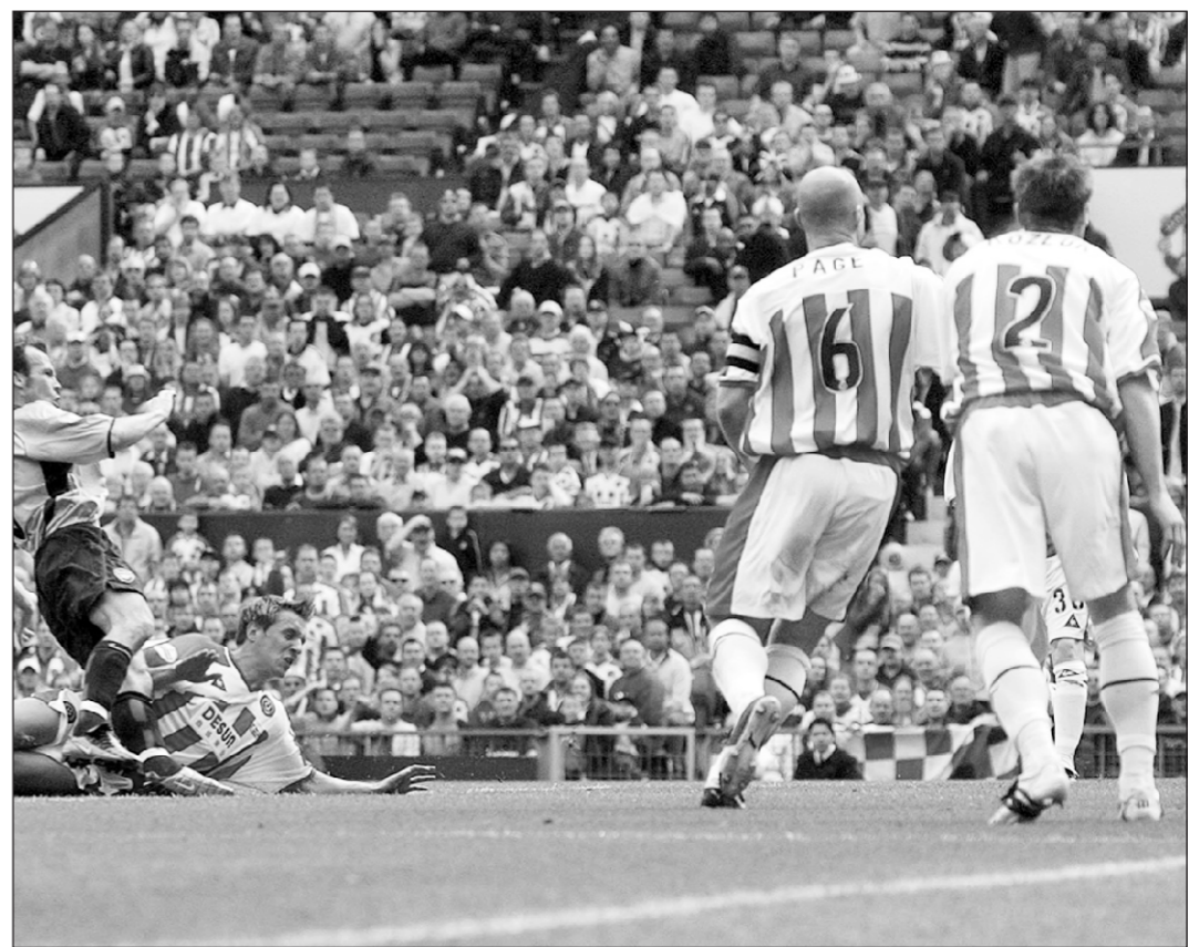
Frederik Ljungberg (L) Arsenal's Swedish international, scoring the match-winner against Sheffield at Old Trafford on April 13.