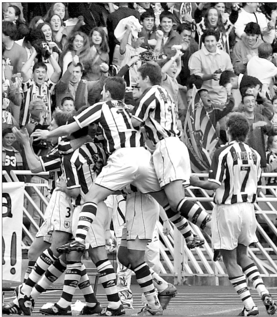
The Real Sociedad squad celebrate their fourth goal against Real Madrid at the Anoeta stadium in San Sebastian on April 13.