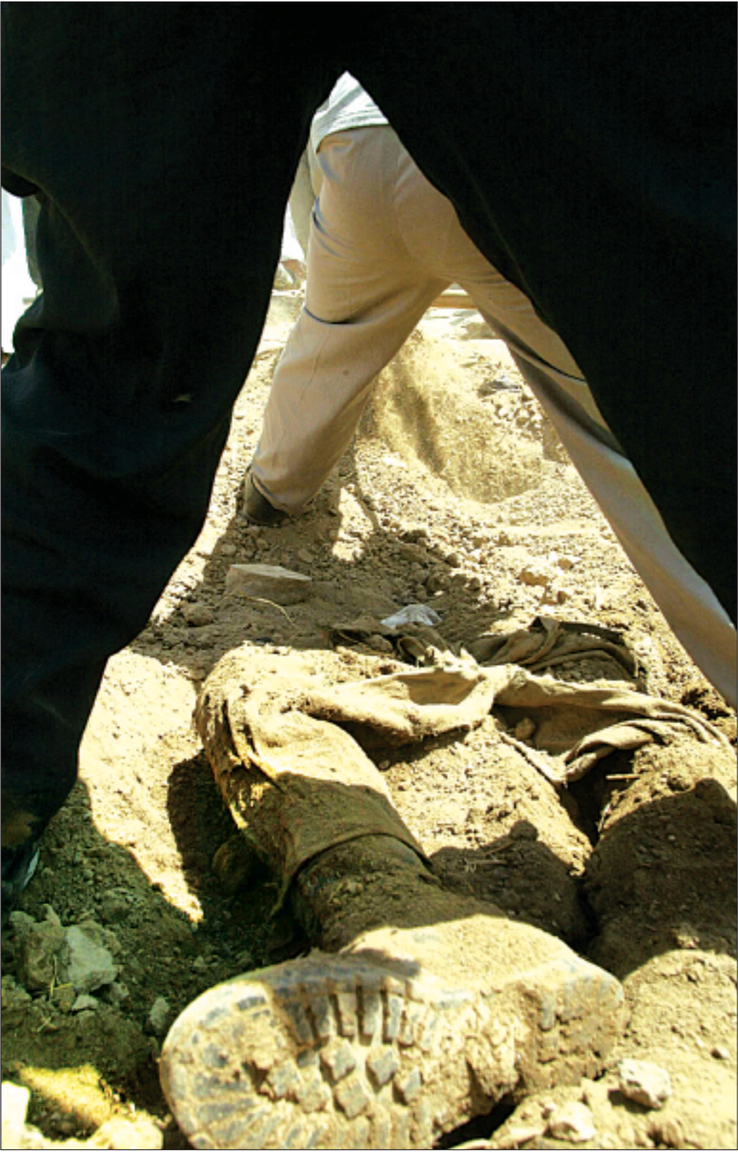
Relatives recover the body of one of nine Iraqi soldiers in Hilla, south of Baghdad on Monday, who were killed when their truck came under a US missile attack during fighting between coalition forces and soldiers loyal to President Saddam Hussein.