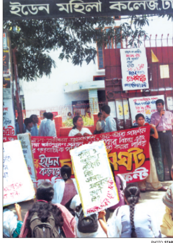
Activists of the Samajtantrik Chhatra Front demonstrate in front of Eden Women's College in support of a strike to protest harassment of the college students.

near Zia International Airport was also kept ready for emergency shelter of the returnees. The taskforce had also requested the United Nations (UN) body, International Organisation for Migrant (IOM), to help Bangladesh in repatriation work. The IOM had also taken preparation to provide necessary assistance in this regard. "Although the taskforce will be in operation till the end of this month, there will be no further regular weekly meetings," said a member of the force. The task force was formed about three months back. Besides regular weekly meetings, there were two national level meetings chaired by Foreign Minister M Moshed Khan and LGRD Minister Abdul Mannan Bhuiyan. Around 1,500 Bangladeshis who had been here on leave, went back to Kuwait. The government, however, had stopped sending fresh workers to Kuwait and Jordan during the war. The government spent Tk 44,700 for the expatriates who had come back because of the war. About 149 expatriates were given special coupons for travelling locally. Tk 300 as pocket money was given to those who had come home empty handed, according to sources. The task force comprised of representatives from the ministries of home, foreign affairs, civil aviation, tourism, religious affairs, works and other government agencies related with the issue.