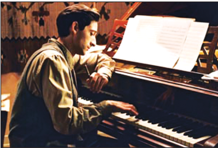
Adrien Brody in the title role of The Pianist by Roman Polanski

Chicago won awards for Best Film, Best Supporting Actress, Best Editing, Best Art Direction, Best Costume Design, and Best Sound. Chicago is the long-awaited film version of the Broadway hit. Set in the roaring 1920s, this is the story of Chicago chorus girl Roxie Hard (Renee Zellwegger) who shoots her unfaithful lover. Landing in jail, she meets Velma Kelly (Catherine Zeta-Jones), another chorus-girl and mur-