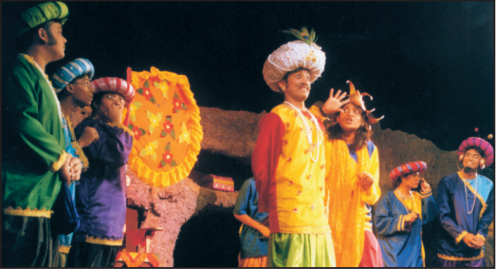
The yes-men crowded court of the Hirok Raj.

It was certainly a courageous attempt for Scholastica to enact a classic piece of our literature like the Hirok Rajar Deshe, which has also been filmed. And it is obvious from their performance that if similar endeavours go on, they will be able to come up with work of professional standard.