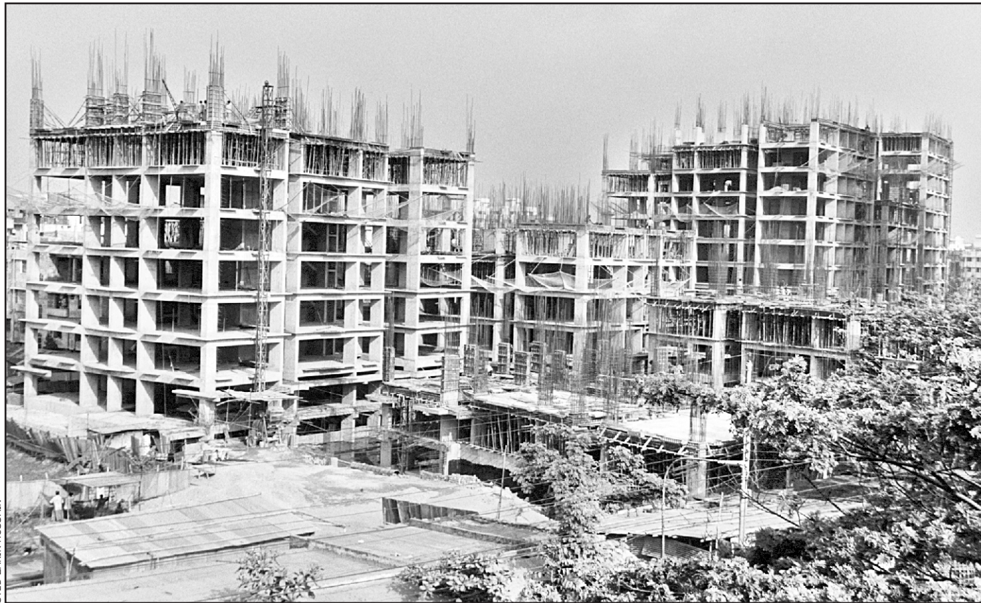
The sprawling Japan Garden City under construction at Mohammadpur

Mohammadpur residents ponder what are the roles of WASA, Titas Gas, BTB and other departments if such giant buildings spring up without a plan.