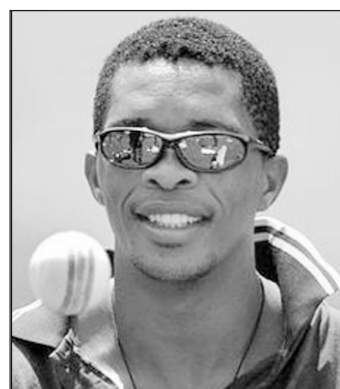
NTINI... 4 for 49

167 in 39.3 overs despite a brilliant opening stand between Aftab Ahmed and Anwar. The two shared a whirlwind 71 runs before Anwar got out. With his