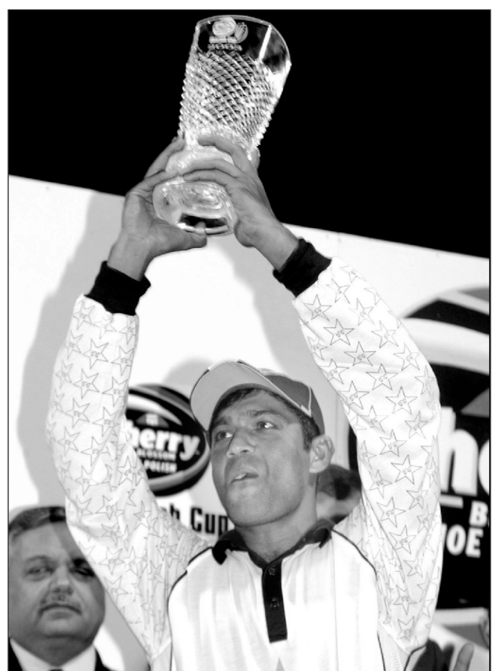
Pakistan captain Rashid Latif holds aloft the Sharjah Cup after the final against Zimbabwe on April 10.