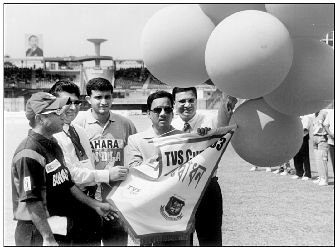
State Minister for Youth and Sports Fazlur Rahman, in presence of the captains of Bangladesh and India and also the BCB president, releasing balloons to inaugurate the tri-nation TVS Cup at the Bangabandhu National Stadium yesterday afternoon.