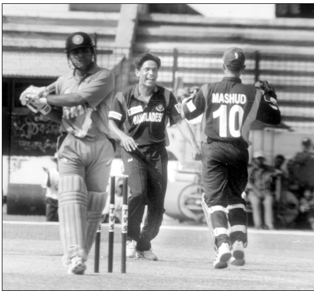
YOU MISS, I HIT: Bangladesh's Mohammad Rafique (M) celebrates the dismissal of Virender Sehwag with team mate Khaled Mashud yesterday. The left-arm spinner trapped the explosive India opener leg before after scoring 63.

He is now firmly established in the team.