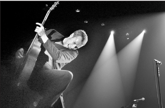
Chris Martin of British band Coldplay performs on stage in Zurich, Switzerland on April 06

The "Women in Art" Exhibition is scheduled to open on Saturday, April 12, 2003 and will continue for 10 days.