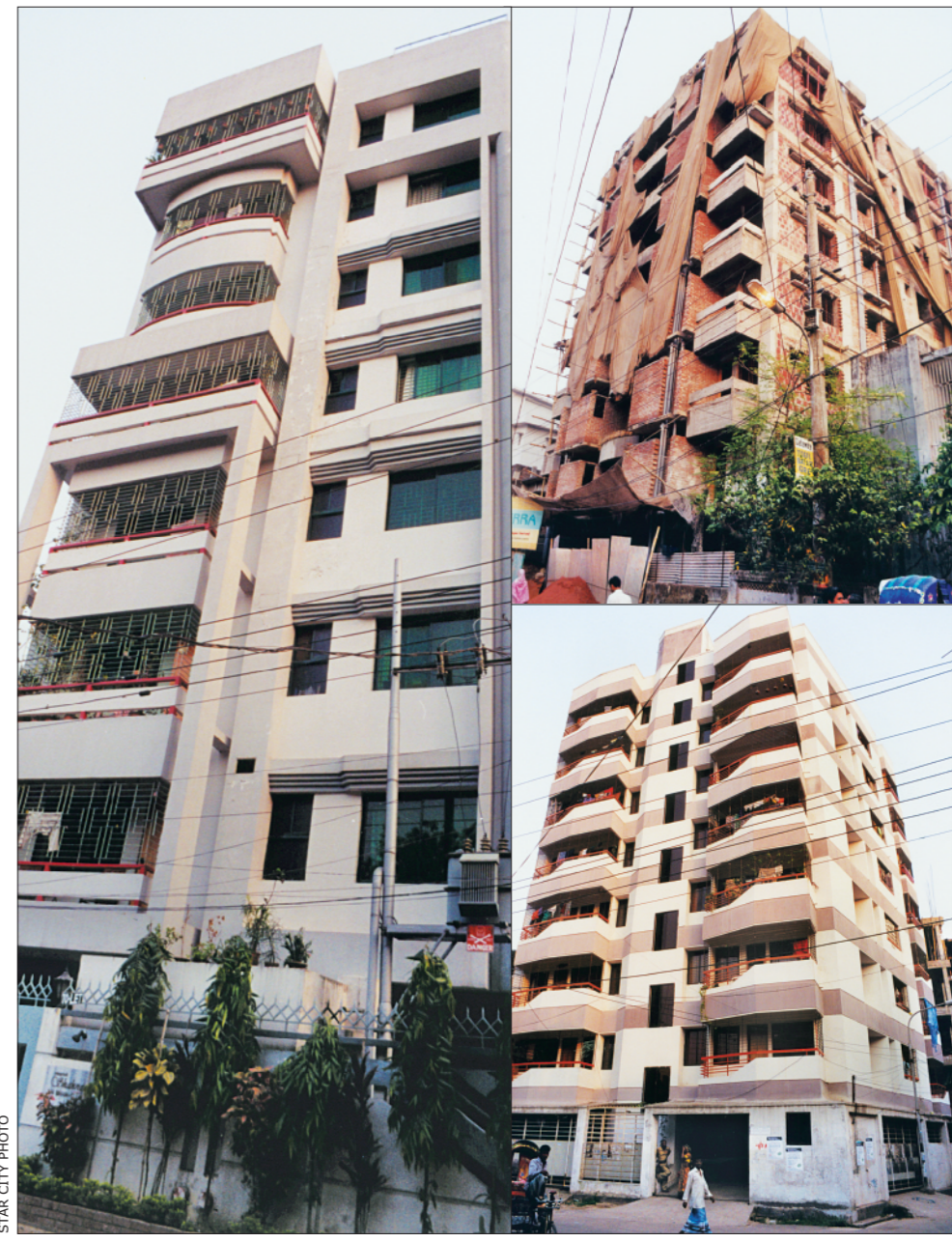
Above the height of law...multistoried apartments sprout in Lalmatia

City planners feel that there is no proper coordination among Rajuk, the CAAB and the housing department in approving any plan.