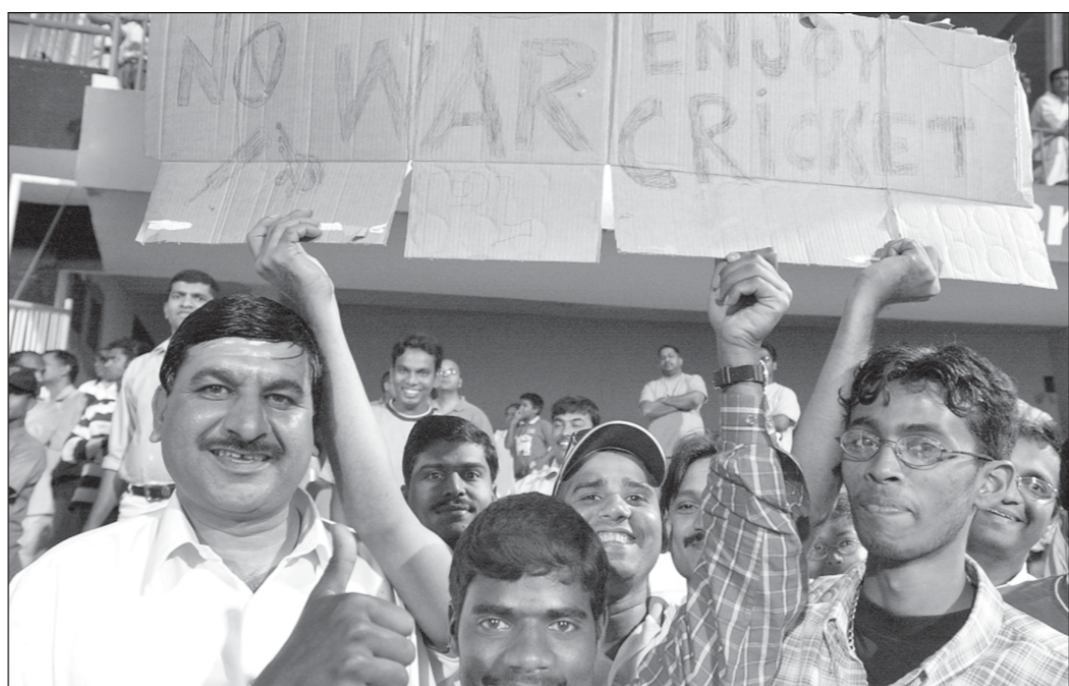
CRICKET DISLIKES WAR: Fans raise a placard reading 'No War Enjoy Cricket' during the Sharjah Cup match between Kenya and Sri Lanka on April 6.

Darren Lehmann followed up his first innings of 44 with a tidy 42, while Martin Love -- who will be promoted to number four in the Test after Damien Martyn was forced out with a broken finger -- posted his second half-century of the match to finish unbeaten on 55.