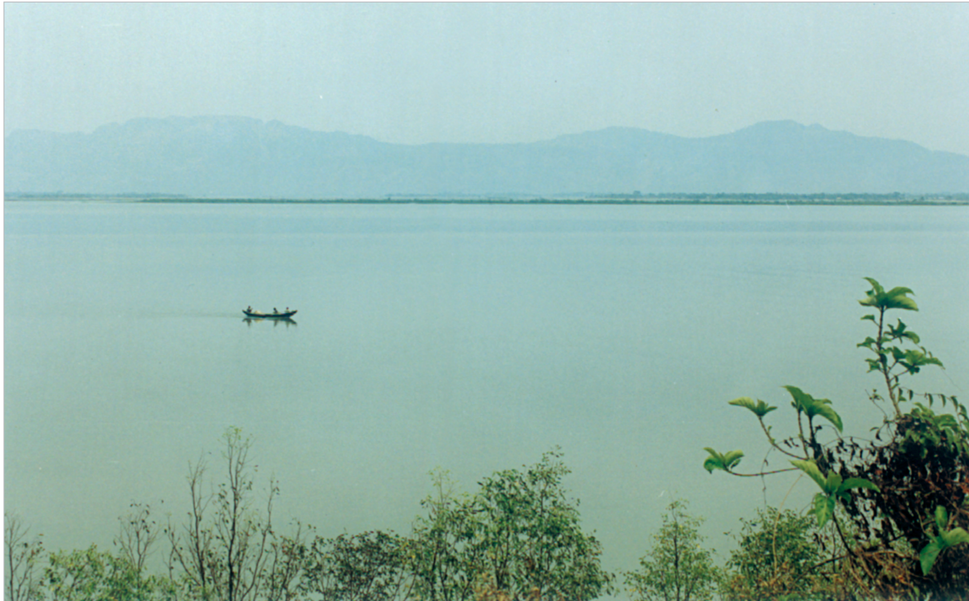
SYED ZAKIR HOSSAIN