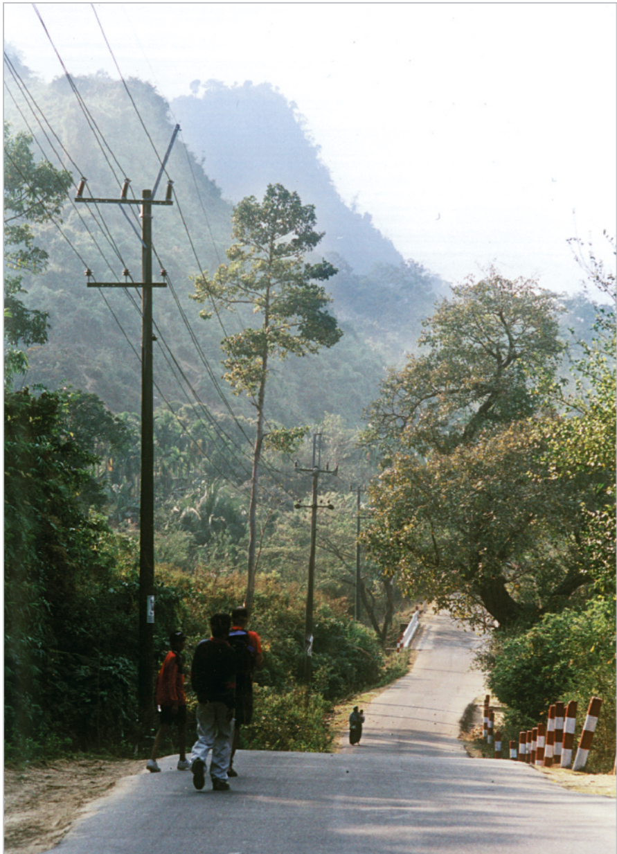
SYED ZAKIR HOSSAIN