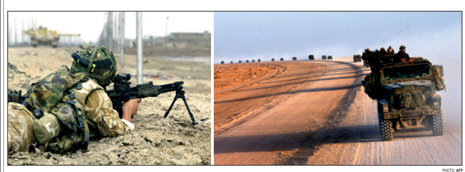
A British soldier, left, aims his machine gun at Iraqi positions as they came under fire in the city of Basra yesterday. Coalition forces still battle for the control of the strategic southern Iraqi city. US roops cross the desert northwards near Diwaniya in central Iraq