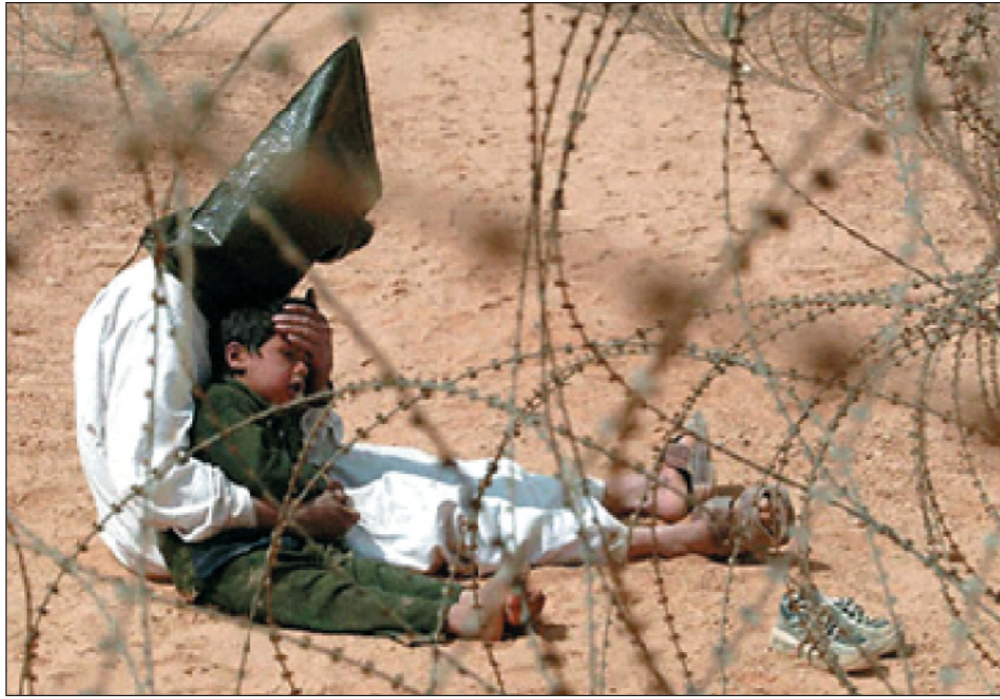
A hooded Iraqi Prisoner of War (PoW) comforts his four-year-old son at the 101st Airborne Division's regrouping centre near Najaf (left). The military did not want to separate the two. A US Marine from the 2nd Battalion/8th Regiment forces the door of a house at the aluminum complex factory in the southern Iraqi city of Nassiriyah yesterday.