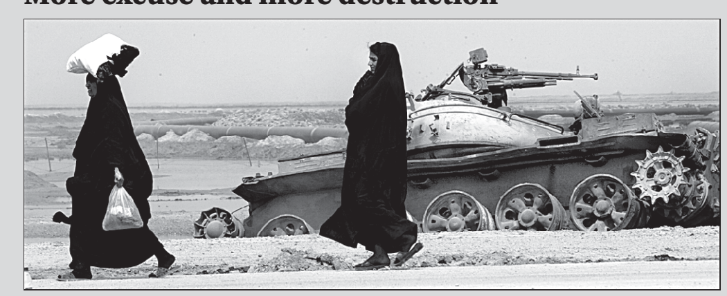
The life goes on

The US-UK invasion of Iraq is increasingly showing itself to be a war against a nation. Bush and Blair have tried mightily to portray their aggression as a conflict with the regime, not with the people of Iraq. But they overlooked that that is not for them to decide. Day by day, the Iraqi people are showing that they have decided the war is on Blair and Bush know this and