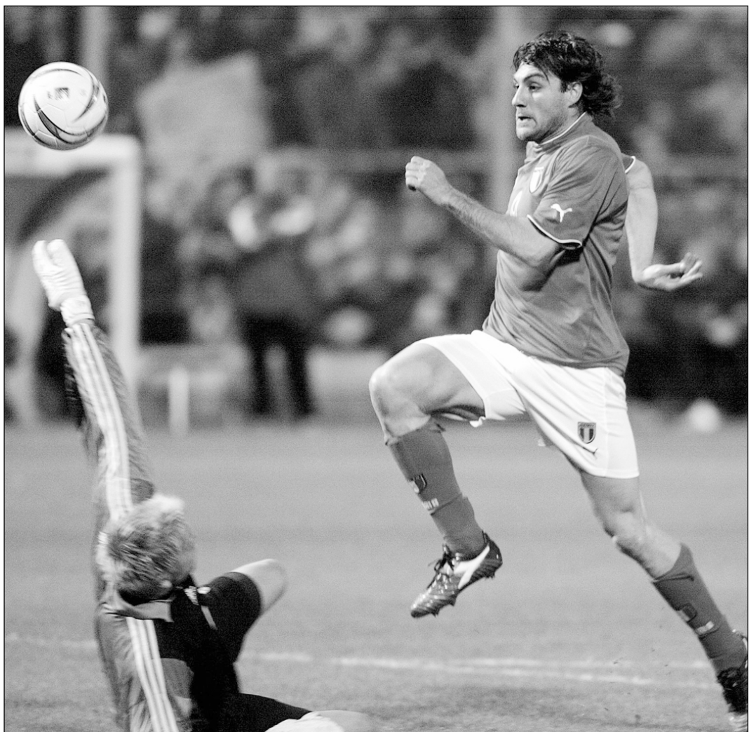
Italy's ace striker Christian Vieri (R) scoring his second goal past Finnish goalkeeper Antti Niemi at Palermo's Renzo Barbera Stadium on March 29.