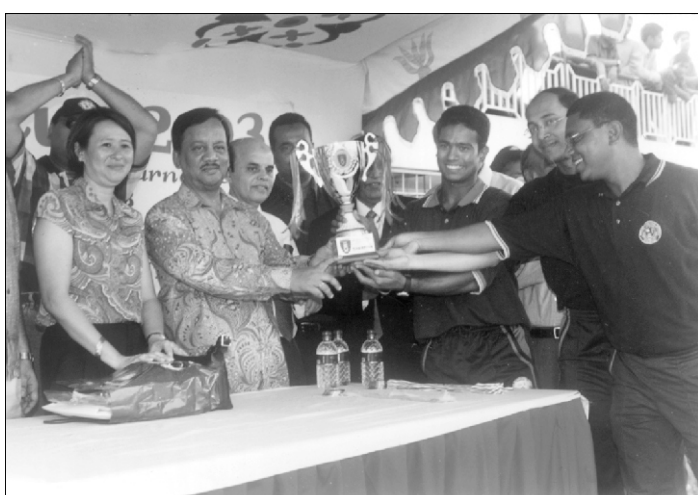
State Minister for Youth and Sports Fazlur Rahman handing over the winner's trophy to the AIUB cricket team yesterday.