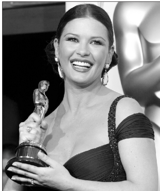
Best Supporting Actress Catherine Zeta-Jones poses with her Oscar after winning for her role in "Chicago" at the 75th Academy Awards in Hollywood, California.

The Academy awarded Salma Hayek's pet project "Frida" with 2 Oscars. The film based on documented life and love of Mexican painter Frida Kahlo won best make-up and best Score (original music written for the film).