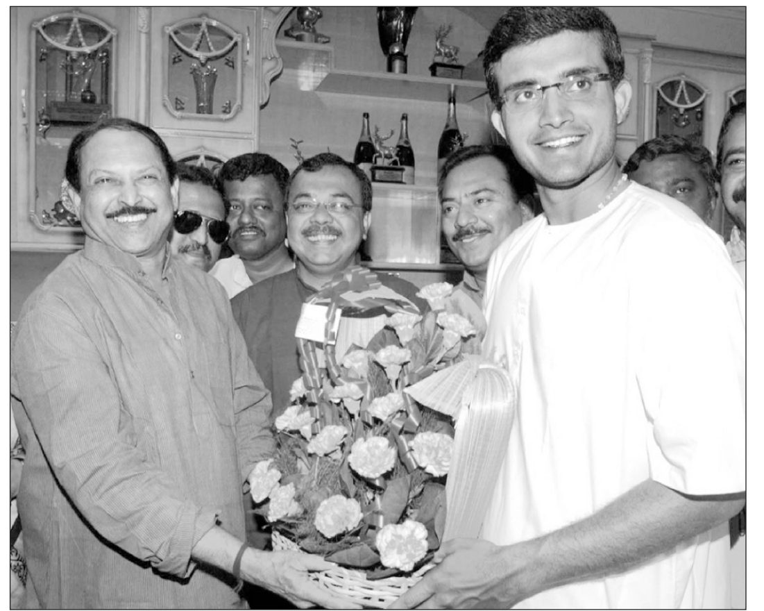
Mayor of Kolkata Subrata Mukherjee (L) presents Indian cricket captain Saurav Ganguly with a bouquet during a visit to Ganguly's residence on March 26.