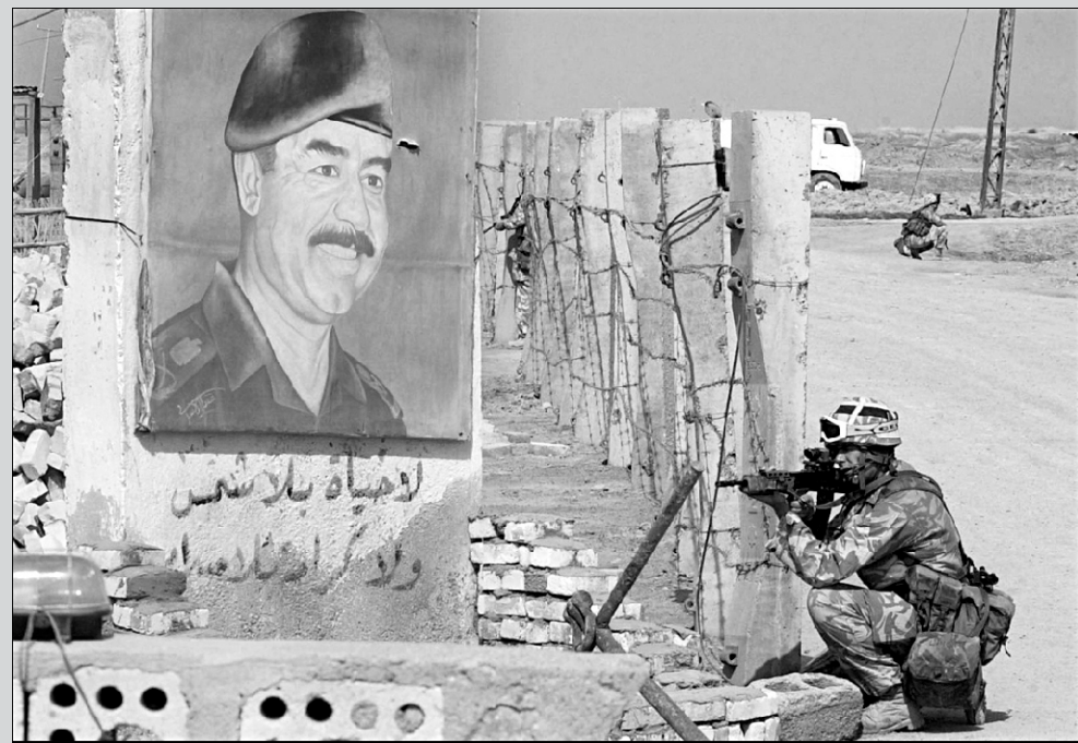
Shoot to kill?

As expected an unholy alliance of the US and UK resorted to naked aggression on Iraq amidst worldwide protest. The troops of the "coalition of the willing" could not take full control of even a single Iraqi city in this week old conflict. The invading army received a jolt when they were resisted at Al Nassiriya and all other fronts. Some were escaping Iraqi assault. Arrested US war prisoners were shown in TV. By violating all international laws Bush is crying for Geneva Convention. Casualties on both sides are at rise at "dramatic" pace. In the prevailing situation, there are few pertinent questions: