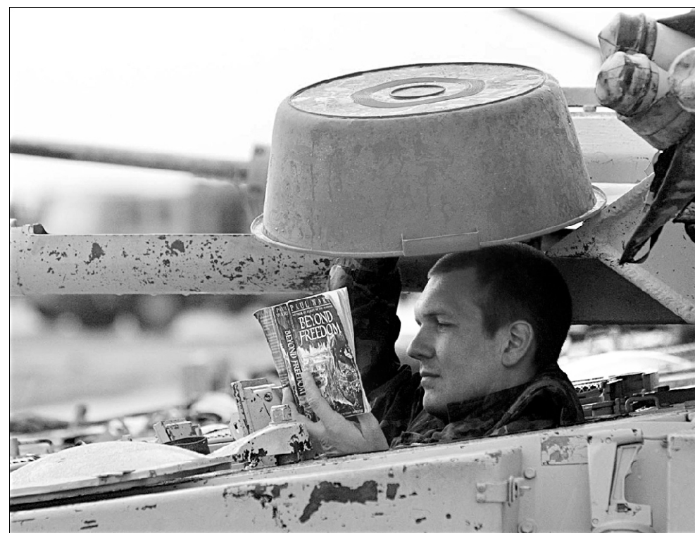
Break time in battlefield!

"We live in the time where we have fictitious election results that elect a fictitious president. We live in a time where we have a man who's sending us to war for fictitious