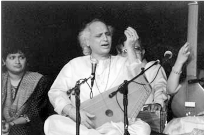
Guruji at one of his performances