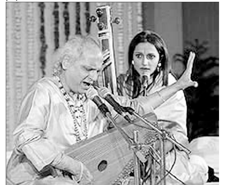
Pandit Jasraj presents a vocal recital flanked by his daughter Durga Jasraj.