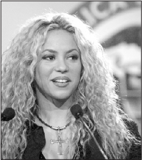
Colombian pop singer Shakira addresses a press conference during a visit to the Narino presidential palace on March 11 in Bogota...