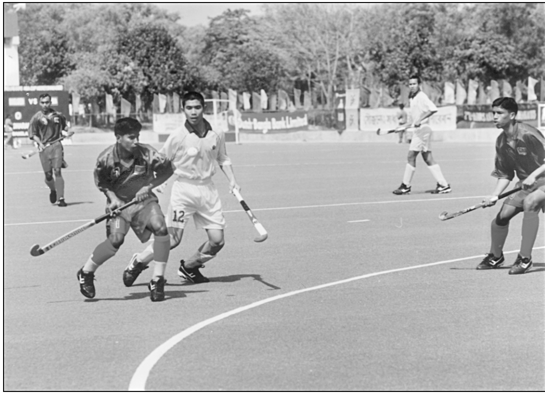
Scene from the Bangladesh-Malaysia match of the Second Under 16 Boys Asia Cup hockey tournament at the BKSP in Savar yesterday.

They trounced Sri Lanka 13-0 in their first match but crashed to a 6-1 defeat against India. They wrapped up their campaign with another efficient display when they blanked Sri Lanka 8-0.