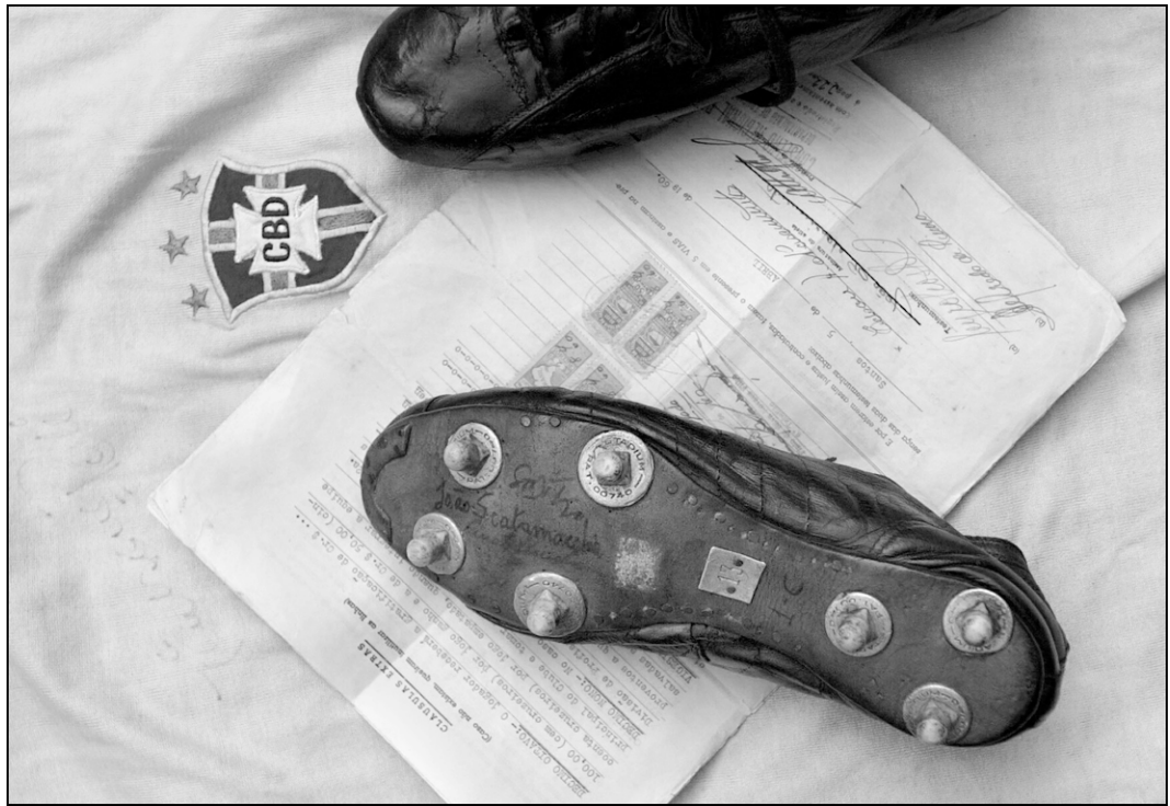
STUFF THAT MAKE A LEGEND: Football legend Pele's Brazilian shirt (back) worn by him in an international match after the 1970 World Cup finals worth £3,000-5,000 (4370-7283 Euro), a pair of black leather football boots worn by him when he scored his 1000th career goal, the sole of the boot bearing a white metal plaque inscribed 13 (13, was his locker number in the changing room) and a letter of authenticity on Santos football club and his original 1960 Santos F.C contract signed and dated 5th April 1960 are up for auction at Christie's in central London on March 7. Total estimated price of the items is between £10,000-15,000 (14,570-21,850 Euro).