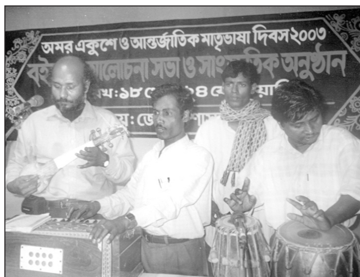
Artistes of Uzial Shilpigoshthi render folk songs at a book fair in Kishoreganj. The week-long fair was organised by the district administration to mark the International Mother Language Day on February 21.