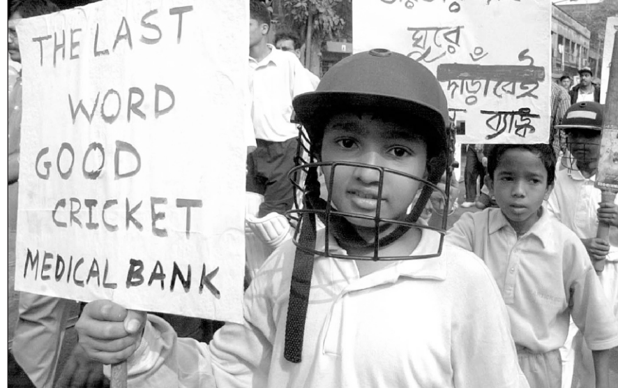
WELL WISHERS: A group of young cricketers, putting on their gears, brought out a peace rally in Kolkata yesterday. They condemned the burning of Indian cricketers' effigies and attacks on their houses.