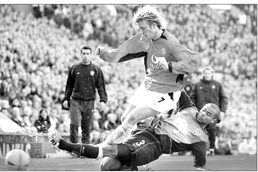
Manchester United's David Beckham comes under a crunching tackle by Arsenal's Ashley Cole during their FA Cup fifth round clash at Old Trafford yesterday.

However the Netherlands put on a good showing in their first game, dismissing India for 204. Namibia, in their first World Cup, got hammered for 340 by Zimbabwe, but performed creditably with the bat before rain cut short their reply.