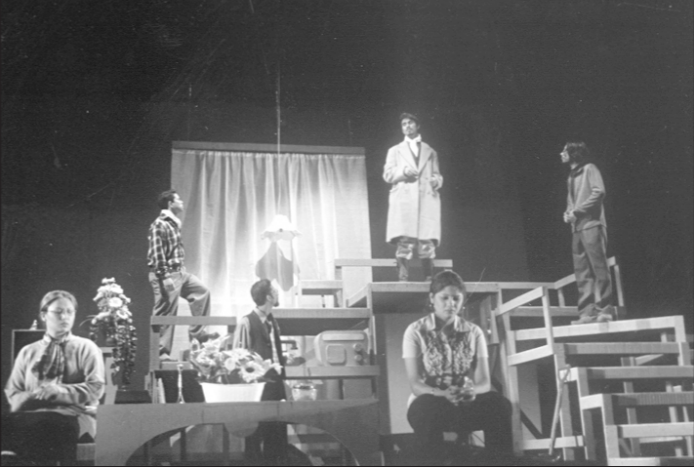
A still from 'The Mousetrap'