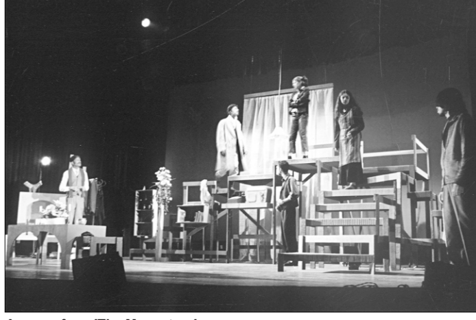
A scene from 'The Mousetrap'

North South University Cine and Drama Club (NSUCDC) performed a translated version of Agatha Christie's 'The Mouse Trap' to mark the 10th anniversary of establishment of the first private university in the country. This murder mystery has been running for more than 50 years at theatres in the United Kingdom and even today attracts thousands of theatre and mystery lovers. After three months of preparations