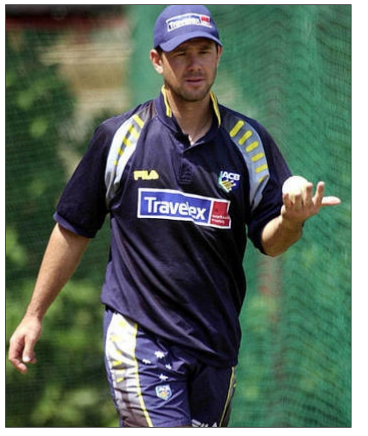
COME AND GET US! Australian captain Ricky Ponting during practice at Centurion yesterday.

India won by 118 runs Australia won by 8 wickets Pune India won by 60 runs India won 20 runs Australia won by 4 wickets Perth Australia won by 152 runs Australia won by 5 wickets Australia won by 28 runs Australia wins 39, India wins 24, Tied/NR: 3