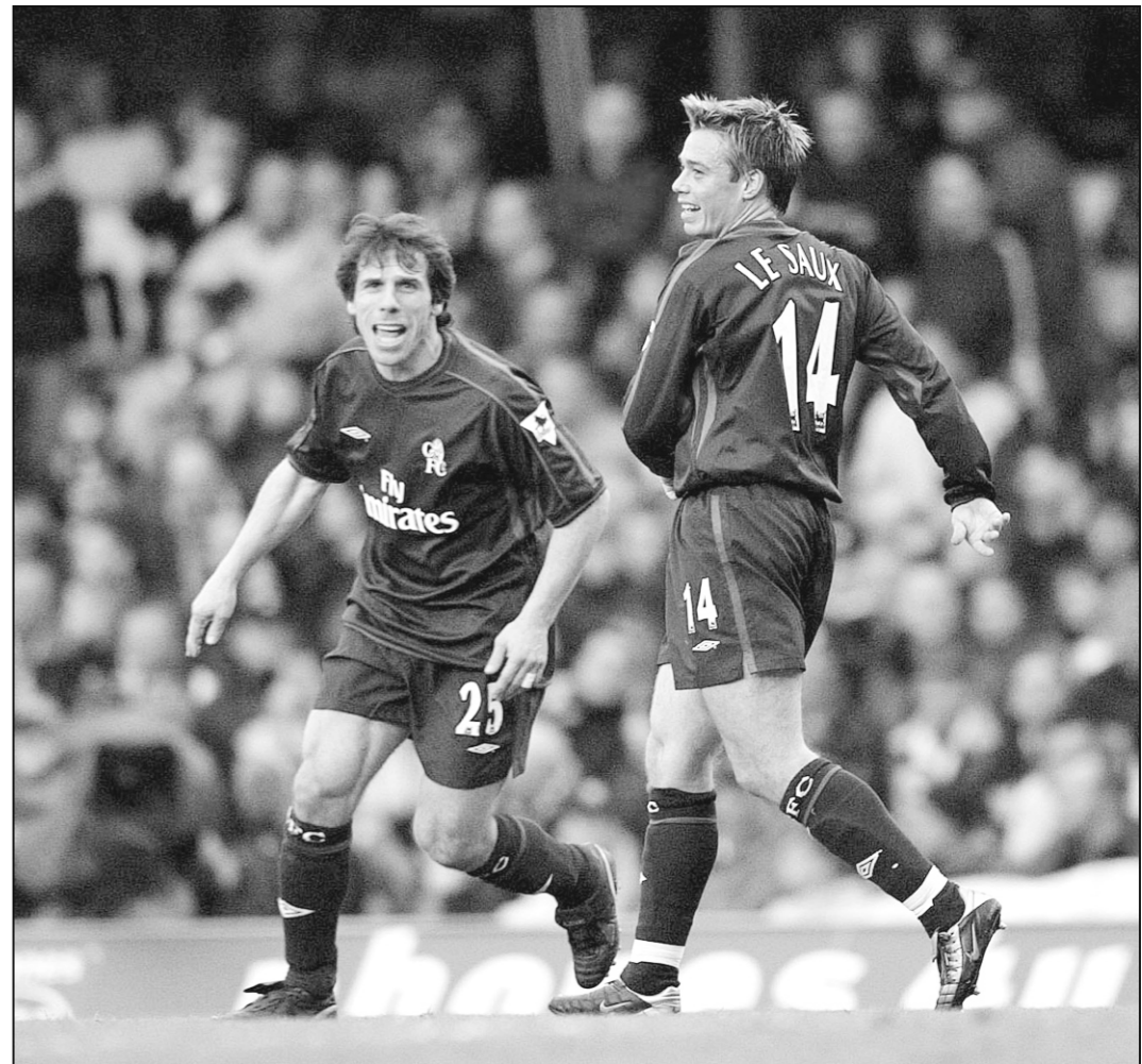
Chelsea's Gianfranco Zola (L) is jubilant after scoring his team's first goal against Birmingham City during their Premiership clash at St. Andrews on February 8.