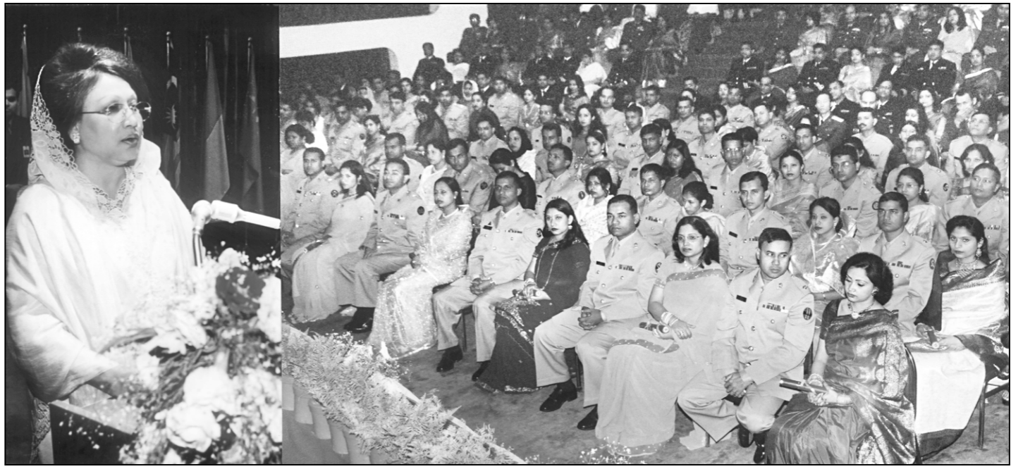
Prime Minister Khaleda Zia speaks at the graduation ceremony 2003 of the Defence Services Command and Staff College at Mirpur in the city yesterday.

Blix said he hoped meetings of UN inspectors and Iraqi scientists unaccompanied by government monitors since Thursday represented "the turn of the tide" in Iraqi cooperation.