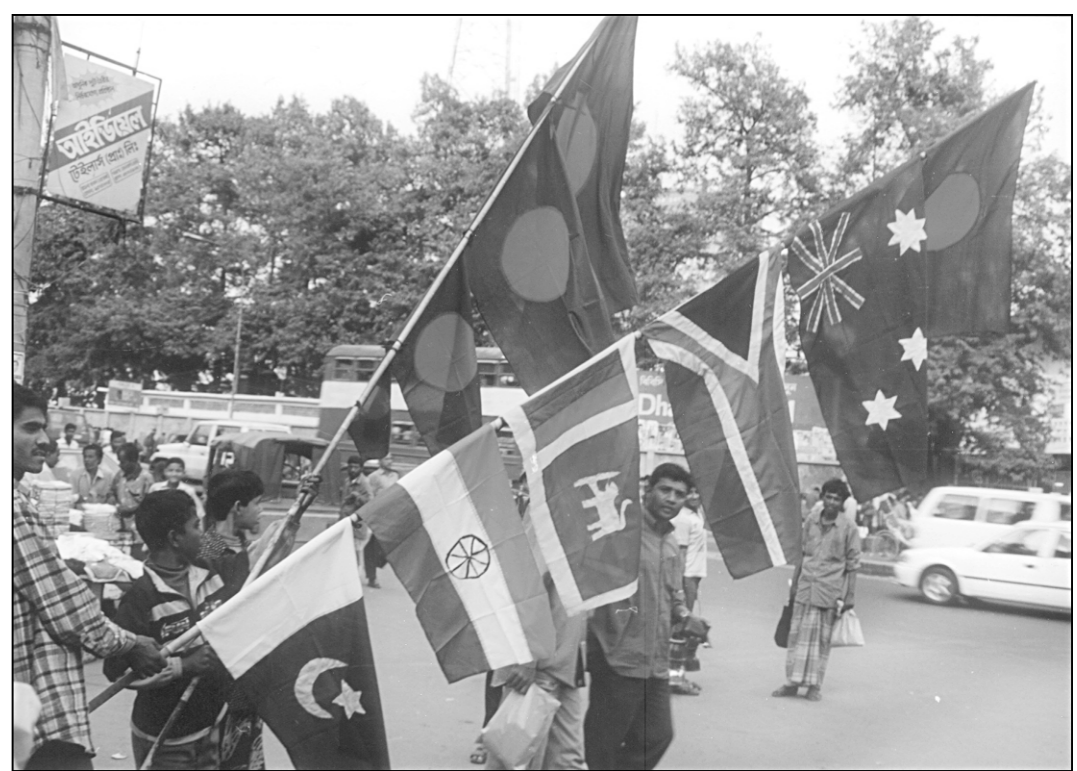
THE QUADRENNIAL FEVER HAS ARRIVED: A vendor on a city street yesterday displaying the national flags of some of the most popular teams participating at this year's cricket World Cup which gets underway in South Africa on Saturday.