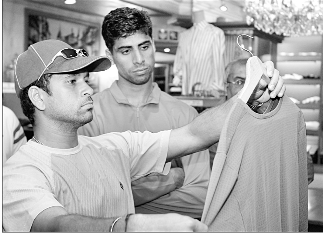
'IS THIS SUITABLE FOR A POST-VICTORY BASH?' India superstar batsman Sachin Tendulkar (L) takes a break from training and looks through the Armani range at 'Casanova', one of the most expensive boutiques in Durban on February 5. To his left is teammate Ashish Nehra.

India, batting second, were in charge until Sachin Tendulkar was stumped for 65. Wickets fell regularly until at 120 for eight, the angry crowd started throwing bottles onto the field from all angles. There was no way the game could continue and match referee Clive Lloyd took the players off the field before awarding the game to Sri Lanka. Meanwhile Australia progressed in conventional fashion beating West Indies by five runs in a thrilling semifinal. It meant they now faced the team they had refused to play a month earlier in the tournament climax in Lahore. Sri Lanka's combative captain Arjuna Ranatunga put Australia in and saw opposing skipper Mark Taylor top score with 74 in a total of 241 for seven.