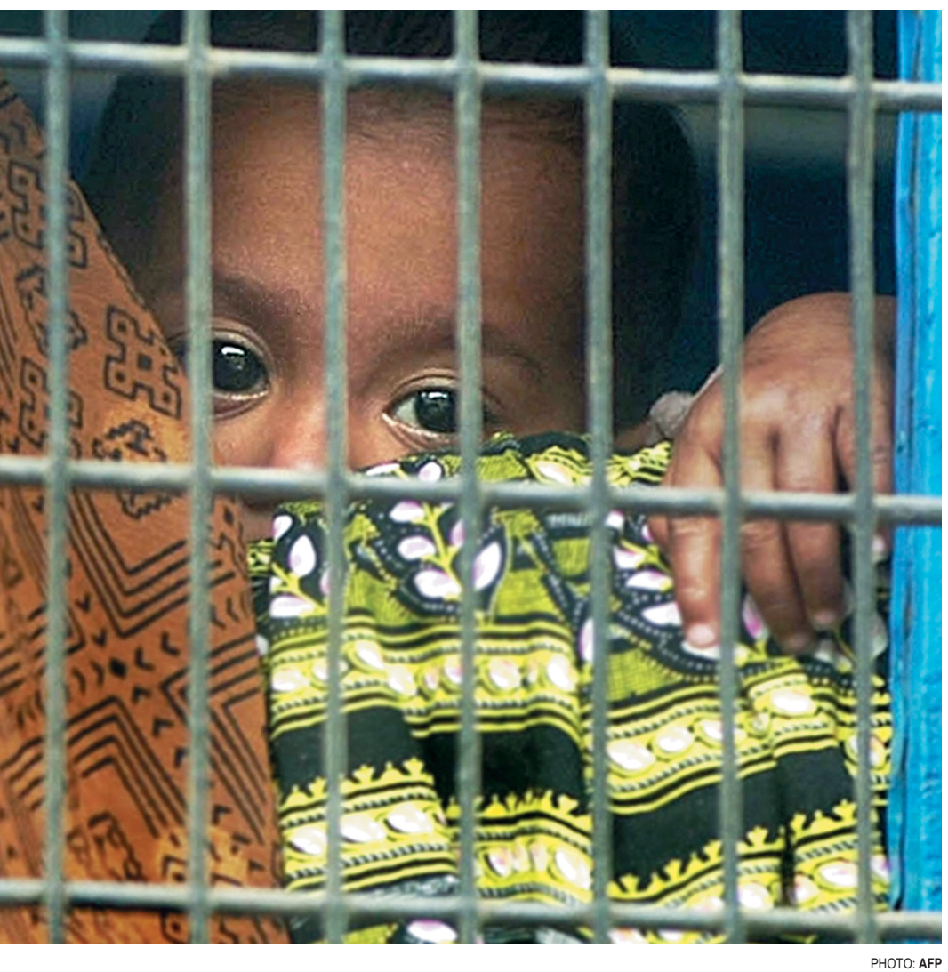
A child peers through the window of a prison van in Howrah, India, yesterday. Ninety-two people allegedly from Bangladesh were produced before court after arrest for their failure to show valid documents

On the frontier, the Border Security Force (BSF) has bolstered its strength by withdrawing paramilitary forces from anti-military oper-