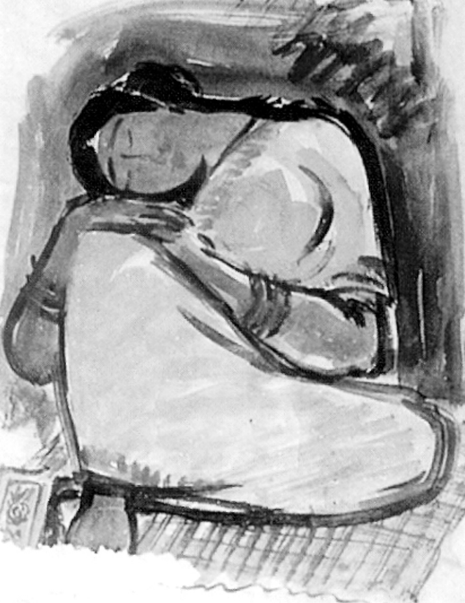
Shilpacharya Zainul Abedin