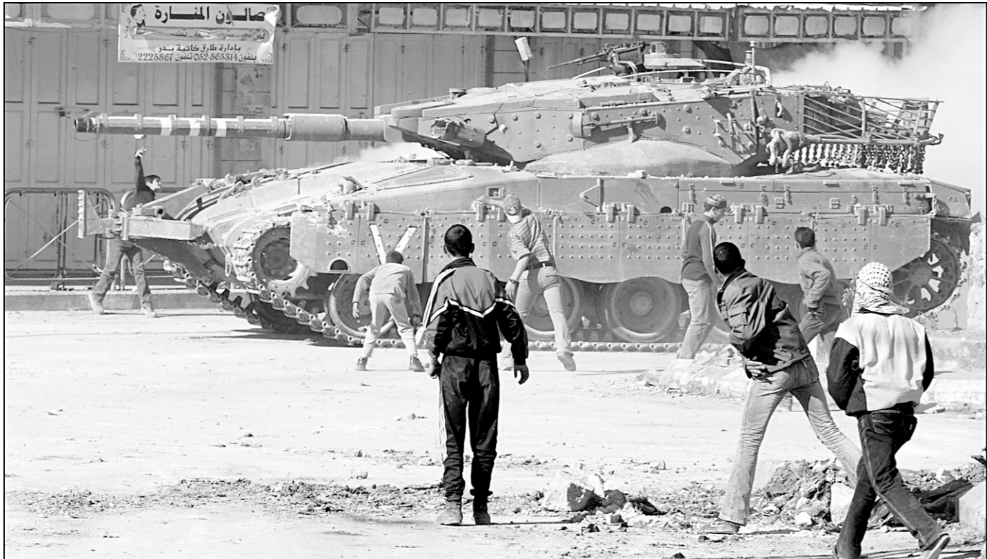
Palestinian youths throw stones at an Israeli tank in the West Bank town of Hebron on Sunday. The Israeli army started the demolition of 22 illegal Palestinian houses and stables, most of them still under construction, in the southern part of this autonomous West Bank town, Israeli and Palestinian security officials said.

Nepal's Prime Minister Lokendra Bahadur Chand said Monday the speed at which HIV and AIDS were engulfing the world was worrying, as he inaugurated a conference aimed at boosting the fight against the disease in South Asia.