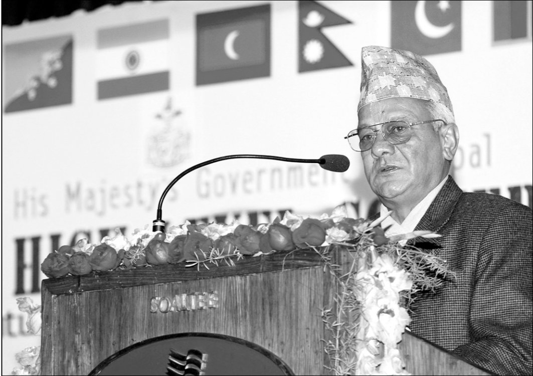
Nepal's Prime Minister Lokendra Bahadur Chand speaks at the inauguration of a two-day international conference on HIV/AIDS on Monday in Kathmandu.

US Secretary of State Colin Powell is to present to the United Nations on Wednesday what the administration considers is proof that Iraq possesses weapons of mass destruction and is deceiving weapons inspectors who have failed to turn up anything of real significance since resuming their work on November 27.