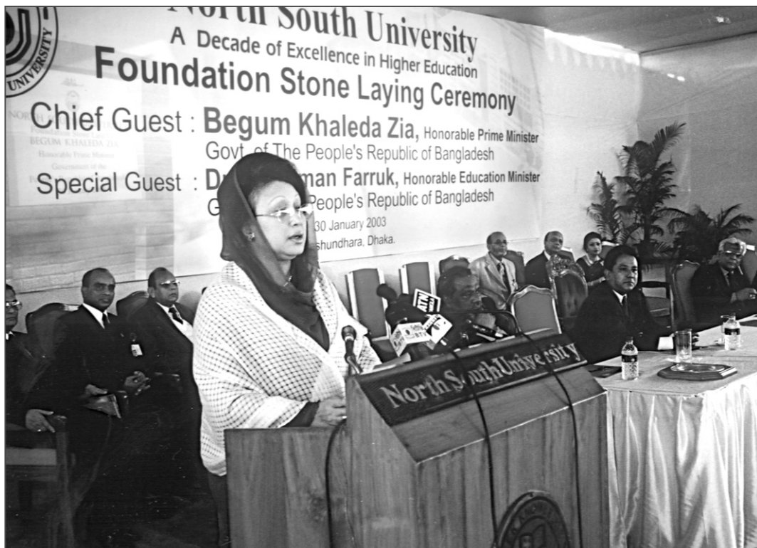
Prime Minister Khaleda Zia speaks as chief guest at the foundation-stone laying ceremony for a permanent campus and tenth founding anniversary of North South University (NSU) in the city yesterday.