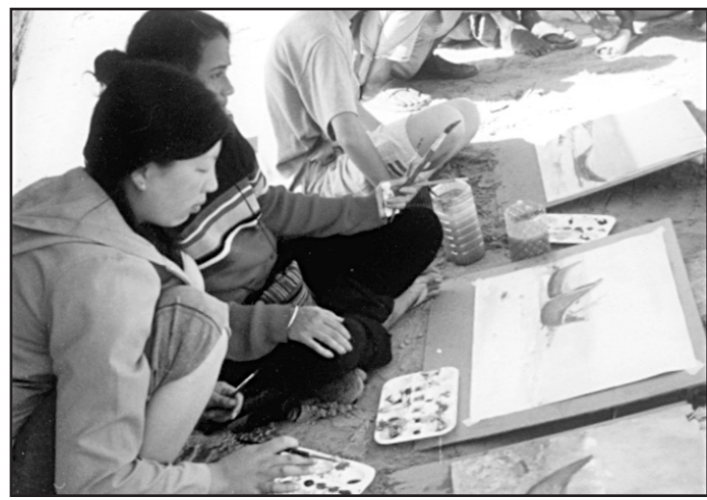
The young students at work with onlookers at St. Martin Island

Jahan Turin from Bangladesh had boats and people in splashes with only hints of the figures. It was done in black, brown and russet, while the water had been highlighted with smudges of blue and mauve against the russet backdrop.