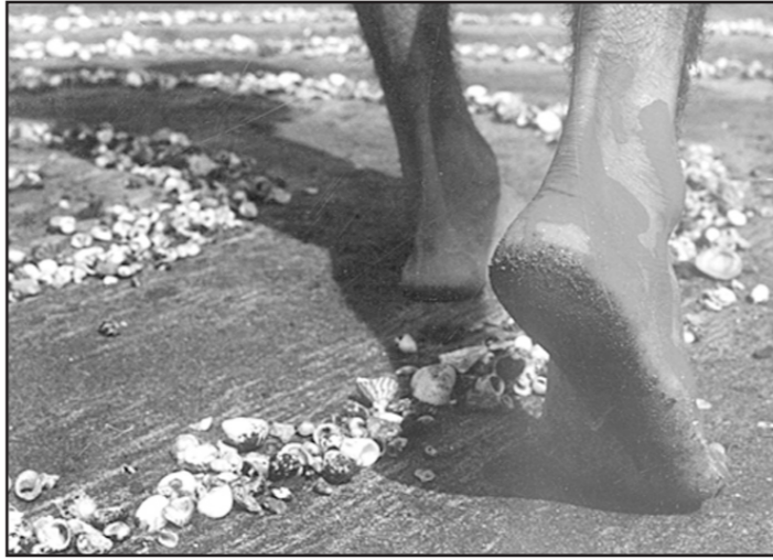
Installation art by Jasimuddin Xecon

Next, "Morning on an island" by Xecon, from Bangladesh, brought in blue and gray cool splashes to depict trees with shadows in front. More in the foreground was the gray and white, with the land depicted with strokes of burnt sienna, burnt umber and daring lines of gray.