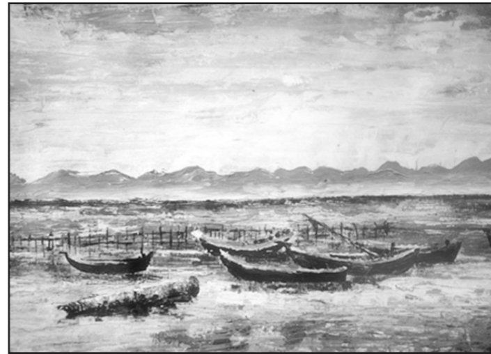
Kama Wangdi's "Looking at Myanmar" (acrylic)

Moving on to an installation by Jasimuddin Xecon, a student of Fine arts Institute, DU, we found four photos elaborating on the theme of destruction of nature around us by mankind. They were rectangular in sizes and were sometimes put horizontally and at times vertically.