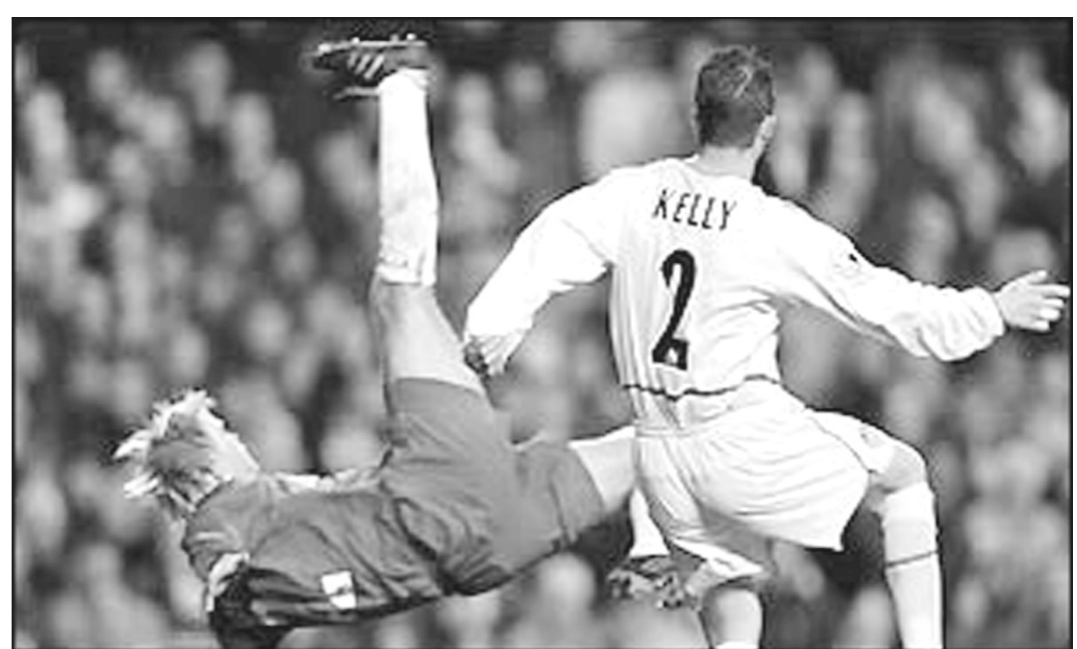
Eidur Gudjohnsen of Chelsea scoring with a spectacular overhead kick to equalise against Leeds at Stamford Bridge on January 27.

Former Pakistan pacer Sarfaraz Nawaz said Wednesday a gambling and match-fixing mafia is active ahead of next month's World Cup in southern Africa and a clean event was not possible. "The gambling mafia is active and World Cup cannot be held without match fixing," Nawaz, who played 55 Tests and 45 one-day internationals for Pakistan, told AFP. The International Cricket Council (ICC) last month claimed cricket's quadrennial event, due to be staged in South Africa, Zimbabwe and Kenya from February 8 until March 23, will be corruption free. The ICC was forced to form an Anti-corruption Unit (ACU) in 2000 headed by former London police chief Sir Paul Condon after late South African captain Hansie Cronje confessed to taking 130,000 dollars to influence results of international matches. Besides Cronje, Pakistan's Salim Malik and Ataur Rehman and India's Mohammad Azharuddin and Ajay Sharma were banned for life after investigations carried out in their respective countries.