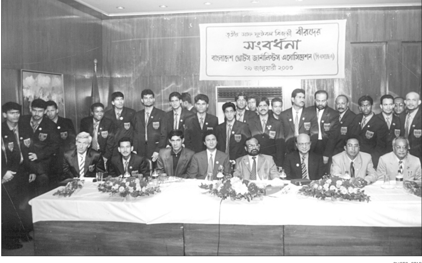
Bangladesh Sports Journalists' Association hosted a reception to the SAFF Championship winning Bangladesh team at the National Sports Council Conference Room yesterday.