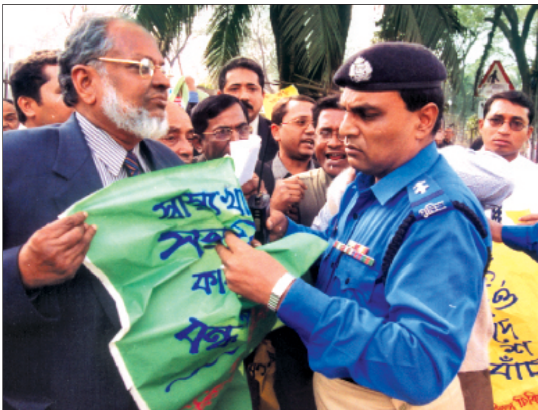
A police officer tries to snatch a poster from a Swadhinata Chikitsok Parishad member during a demonstration in front of the Jatiya Press Club yesterday.

Officials and political activists having strong links at Hawa Bhaban, a power centre of the ruling BNP, are giving clearance to those contractual appointments. Officials at the PMO said that one of the two political secretaries and an assistant private secretary to the PM are handling the matter. Source said some secretaries, who have already been awarded contractual appointment, had to agree to give more 'business facilities' to the ruling party men before they were selected. They said the officials, who are seeking extension of their services, have to maintain contact with Hawa Bhaban through a particular assistant private secretary. "There is no way to get extension, promotion or good posting without the clearance of the APS concerned, and thus the officials are forced to go to the most junior officer, an assistant secretary," said a top bureaucrat.