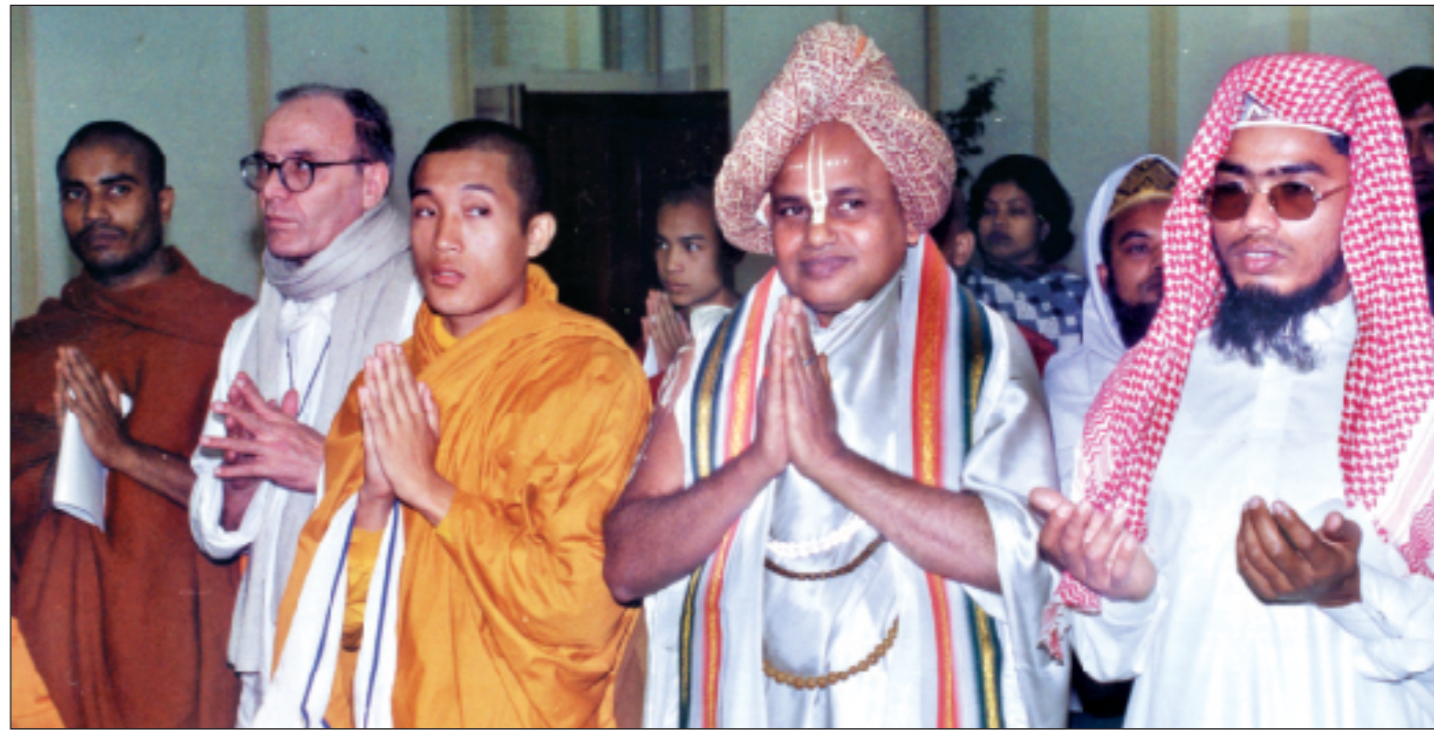
Representatives of Muslim, Christian, Hindu and Bouddha communities in the country lead a prayer for world peace at the World Trade Centre conference at a city hotel yesterday.