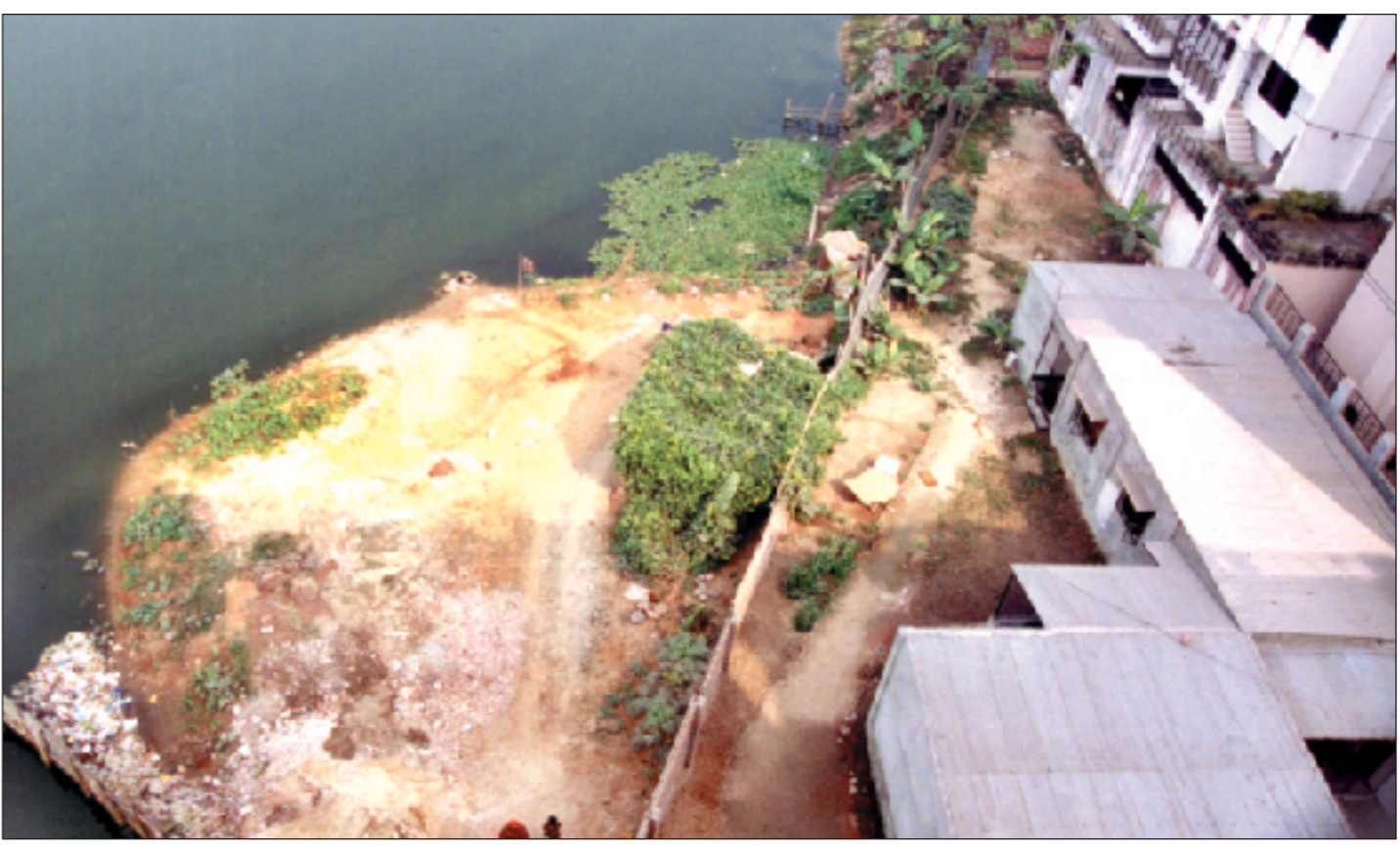
A bird's eye view of a section of the Gulshan Lake at Road No. 29, encroached upon overnight about two weeks back. The encroachers knocked down a wall and filled part of the lake.

BSF again tried to push in about 40 people at Kathalpur. The BDR also got informed that more people were being pushed into 12 other areas. These are Roghunathpur, Ghiba, Gatipara, Teroghar, Taltola, Railgate, Kolachipa, Napatbari, Idubari, Doctorbari, Pota and Kathalpur. SEE PAGE 11 COL 3