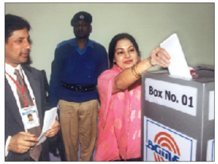
A voter drops her ballot during the BGMEA election yesterday. Foiled once, the polls were finally held under strict police protection.

STAFF CORRESPONDENT Voters turned out in large numbers in yesterday's election of Bangladesh Garment Manufacturers and Exporters Association (BGMEA) amid fears of further government intervention. Despite a last minute boycott by the Oikya Jote panel that enjoys the ruling BNP's blessings, 73.6 per cent votes were cast during the polling of the largest trade body. In the last election 86 per cent votes were cast. Voting in Dhaka and Chittagong began at 8:00 in the morning and ran through 4:00pm. The Oikya Jote's rival Sammilito Parishad Forum was cruising to a comprehensive victory having bagged 1232 of the 1561 votes in Dhaka and Chittagong, according to the first unofficial count. Two rival groups announced their panels with 27 candidates from SEE PAGE 11 COL 7