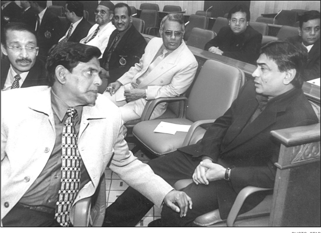
Football superstars of yesteryears Zakaria Pintu (L) and Kazi Salahuddin talk while attending a reception to the SAFF champions Bangladesh team members at the PMO yesterday.

Security was beefed up for India's cricket captain Saurav Ganguly on Friday after police indicated his life may be threatened by suspected Kashmiri militants, police officials said.