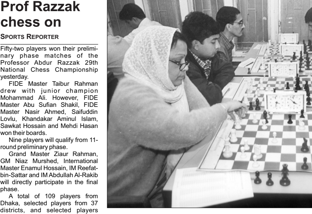
Scene from the opening round of the national chess championship at the National Sports Council conference room yesterday.

Fifty-two players won their preliminary phase matches of the Professor Abdur Razzak 29th National Chess Championship yesterday.