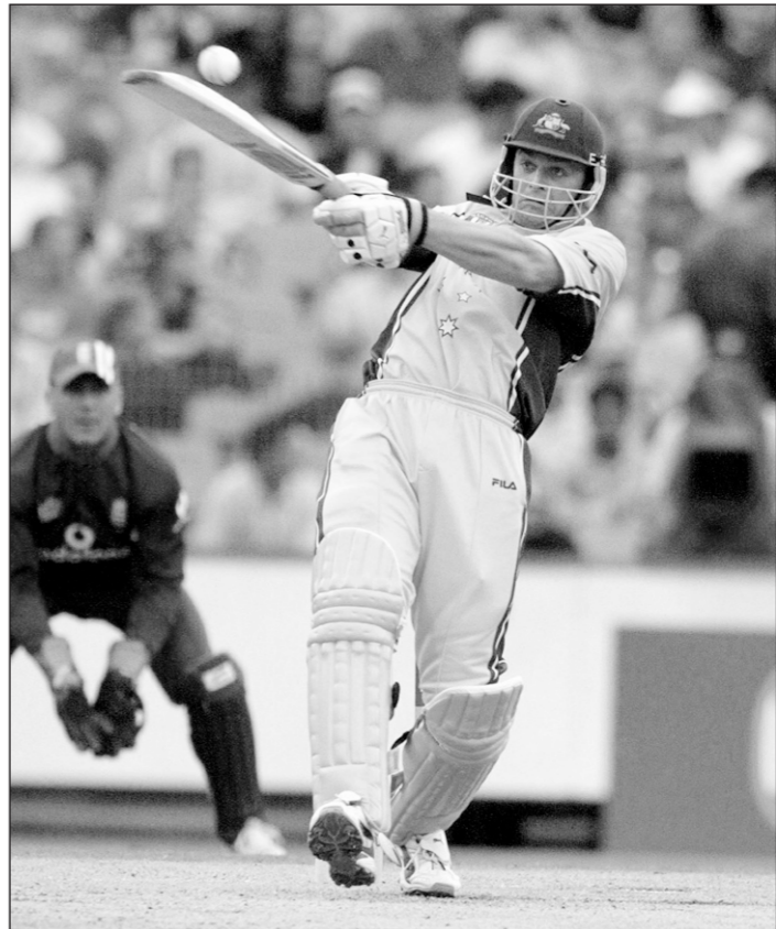
ADAM IN FULL SWING: Australia wicketkeeper-batsman Adam Gilchrist pulls one powerfully during his whirlwind 69 off 37 balls against England in the first game of the three-match finals at Sydney yesterday.