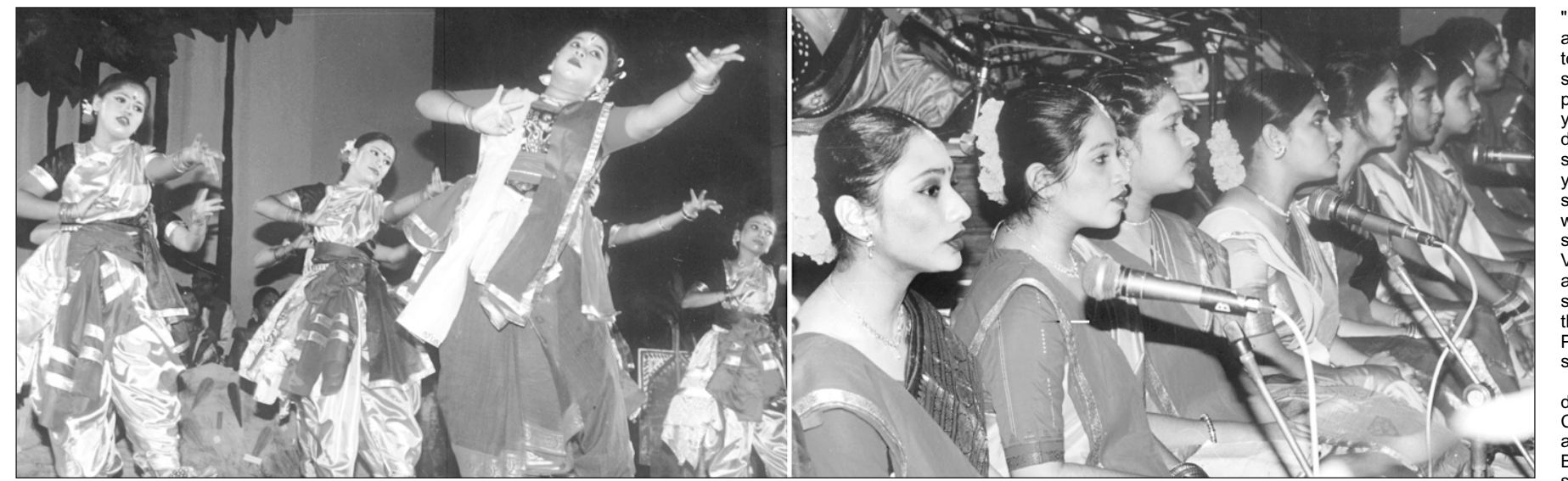
The young dancers and singers of "Sunbeams" presenting "Chitrangada'

weeks. They had rehearsals at home too, dancing for half an hour to an hour every day. What is essential for a successful dance is regular daily practice for an hour at home apart from the rehearsal with the others. Also, when dancing on stage, you must get into the personality that you are playing.